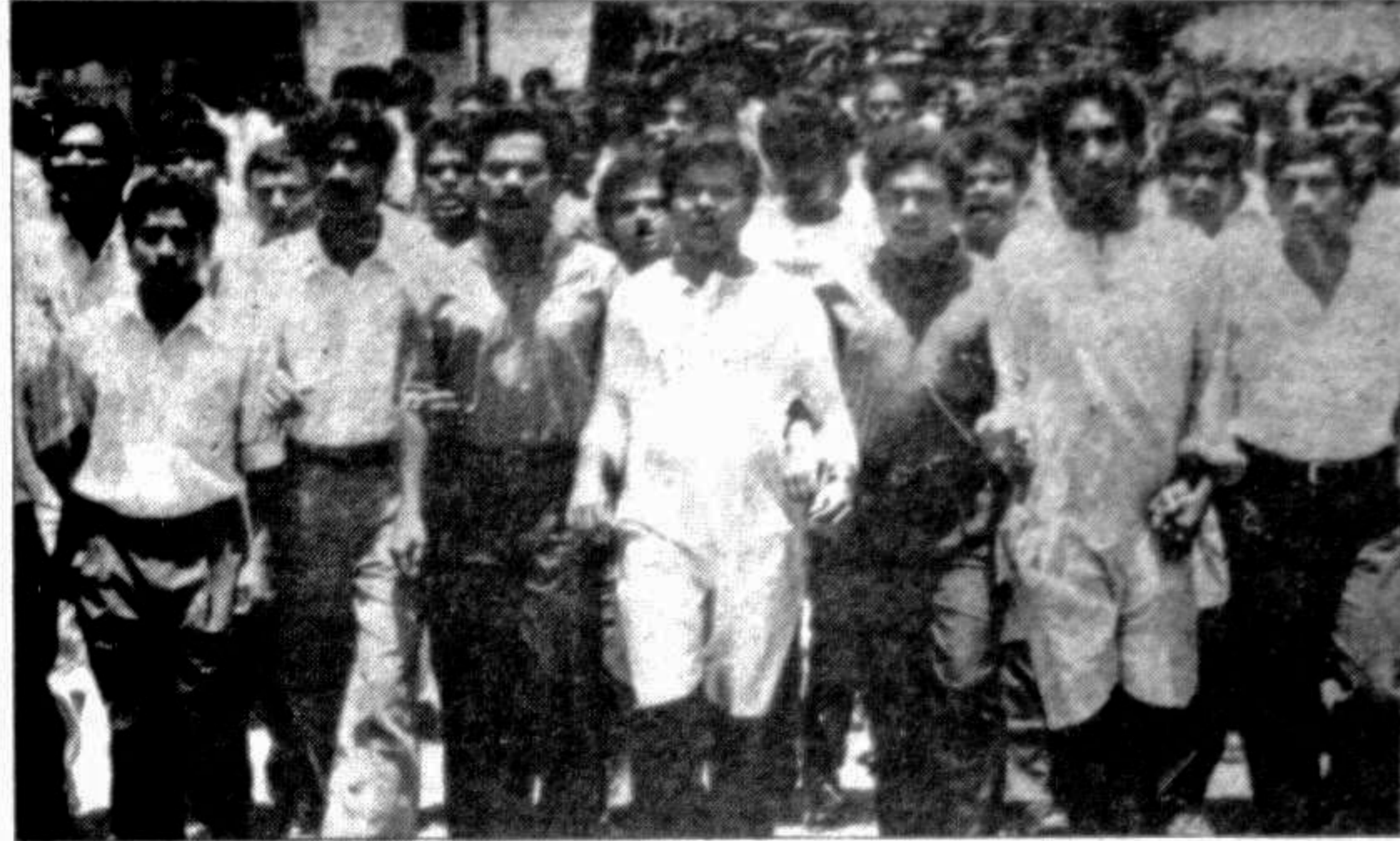
Jatiyatabadi Chhatra Dal brought out a rally on Dhaka University campus yesterday protesting the killing of its leader in Chittagong.

To a query, the employee said the library is exclusively used by members of parliament and officials of the parliament secretariat. The demand for books on literature is rather rare, he added.