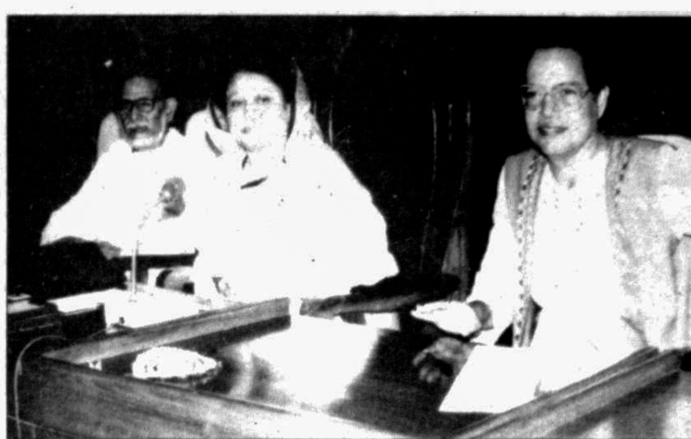
Prime Minister Begum Khaleda Zia presiding over the Bangladesh Nationalist Party Standing Committee meeting at the Jatiya Sangsad yesterday. Story on Page 1

Tender Notice বিদ্যুৎ বিল নিয়মিত পরিশোধ করুন