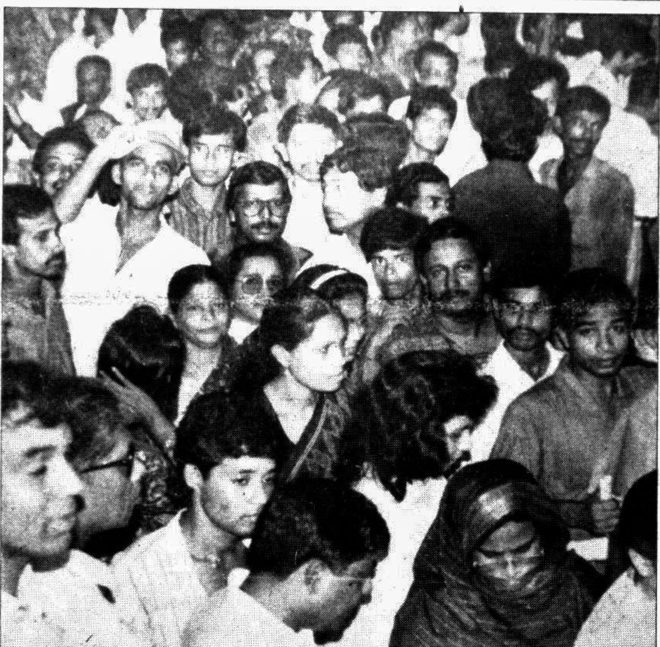
Rush for Nikunja plot forms at Rajuk office yesterday.

The government announced See Page 12 Col 8