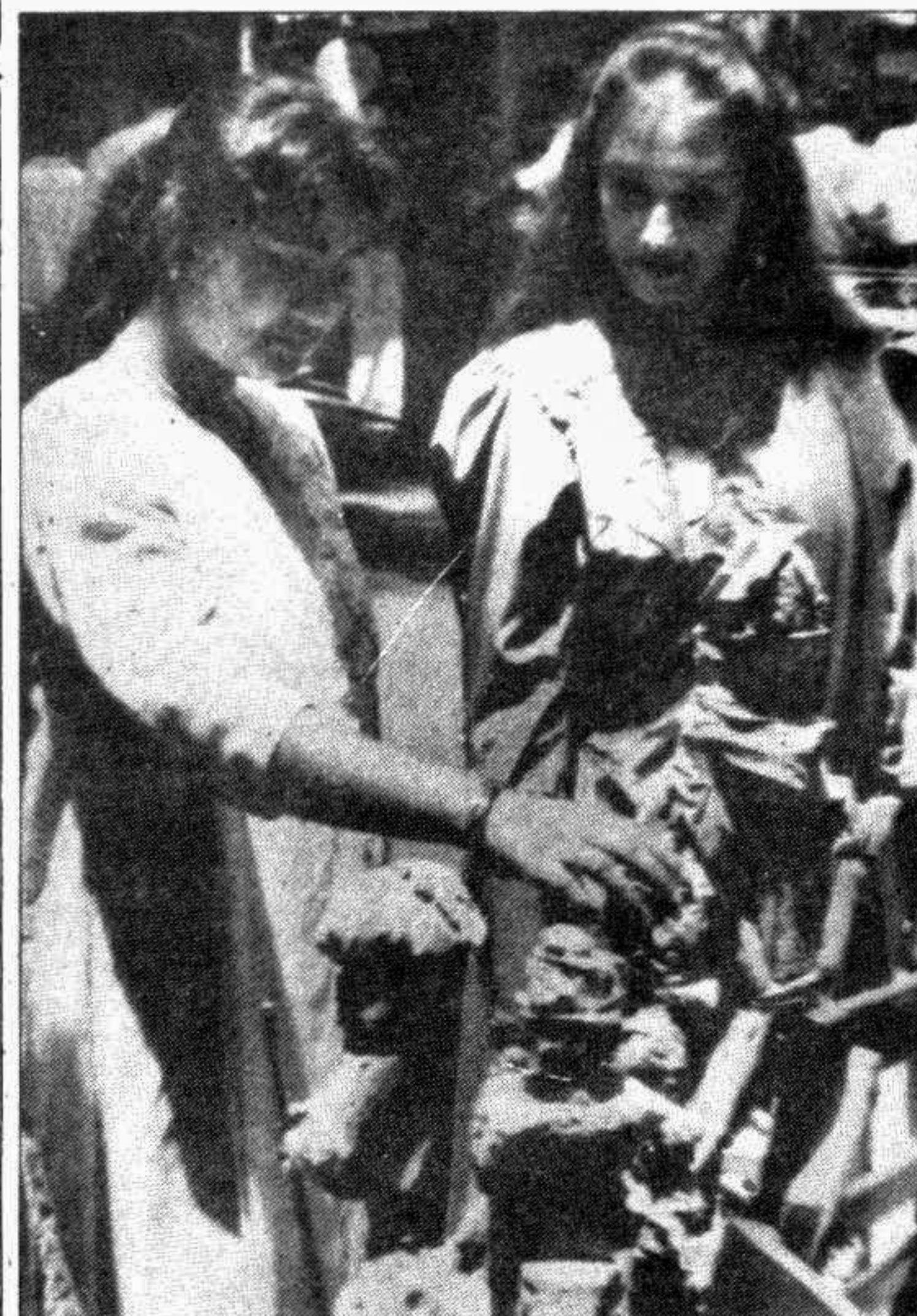
Meena Bazar at Sir Salimullah Medical College.