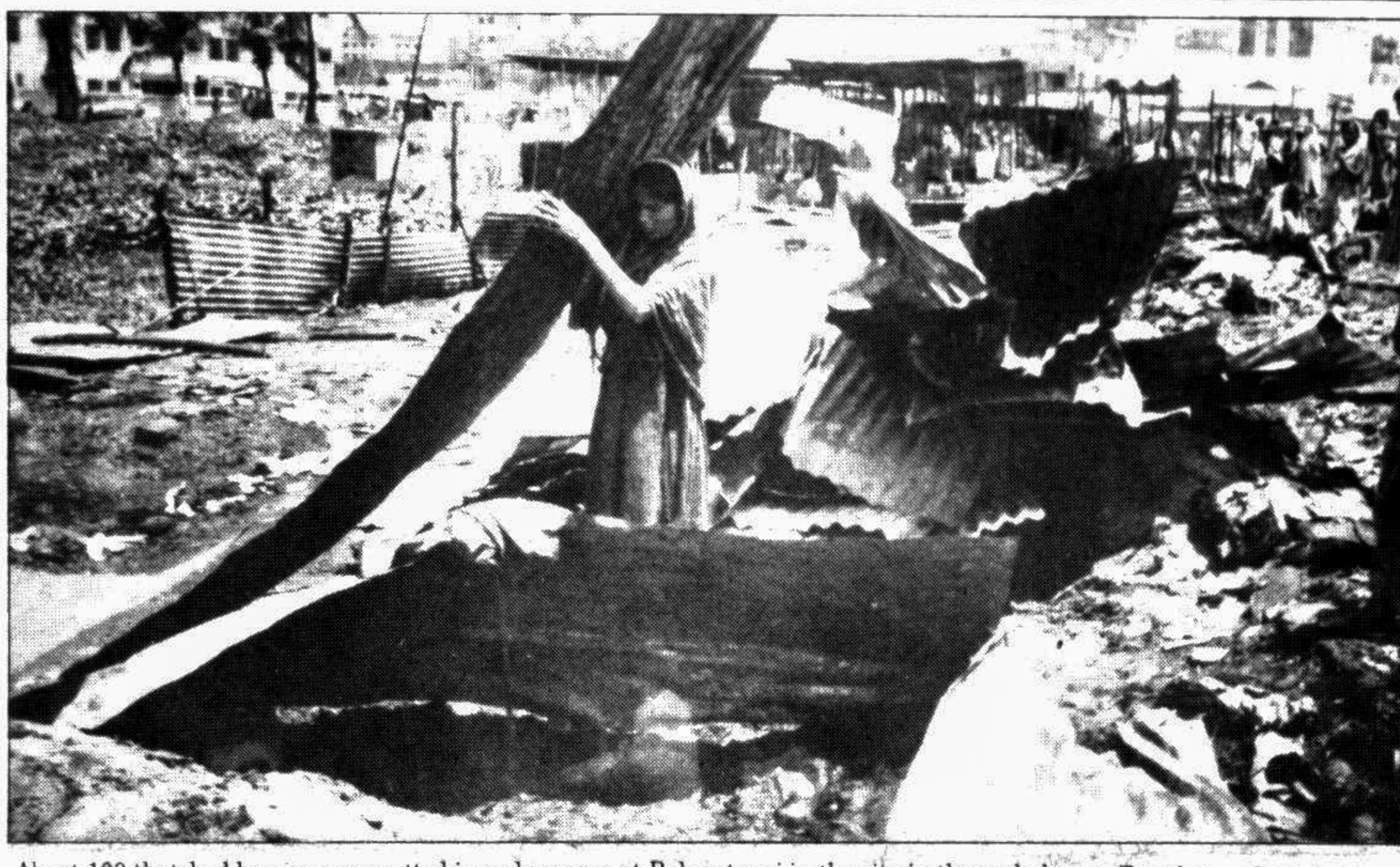
About 100 thatched houses were gutted in a slum area at Rahmatganj in the city in the early hours Tuesday.