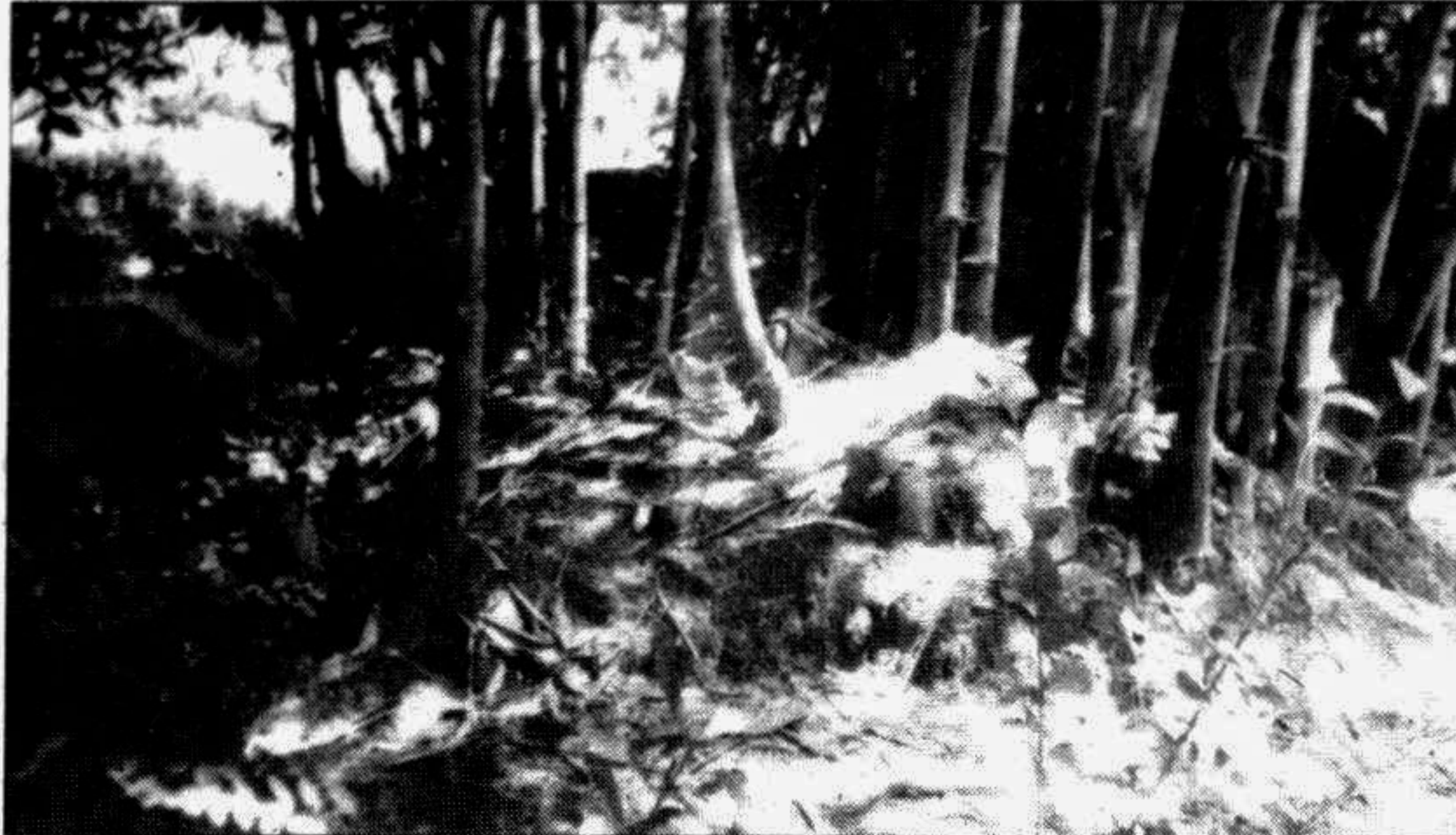
MADARIPUR: The bamboo clusters in the district are on way to destruction due to large-scale cutting and absence of proper care.

From Our Correspondent July 8: Agricultural production has been adversely affected by the mineral deficiency of soil in nine thanas of the district. Agronomists said that the shortage of minerals like Sulphur and Zinc in soil had caused decline in paddy production over the last year. They attributed unrestrained use of chemical fertilizers in croplands to be the cause behind the decrease of soil productivity. The affected thanas are Pakundia, Hossainpur, Katiadi, Bhatrab, Tarail, Karimganj, Kuliarchar, Kishoreganj Sadar and Bajitpur. Mineral deficiency has affected about 60 per cent cropland in the thanas, they added.