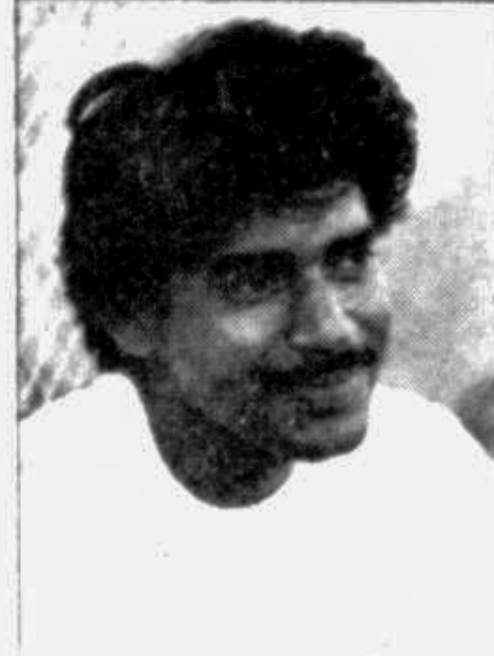
AAQIB JAVED ...fined