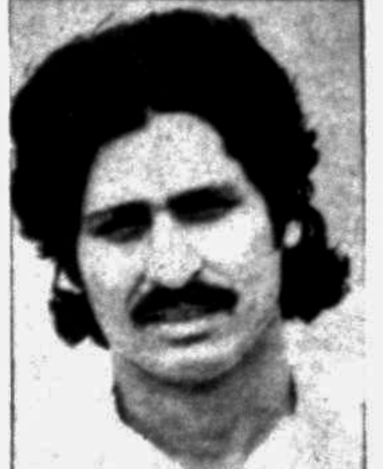
RAMIZ RAJA...88 not out