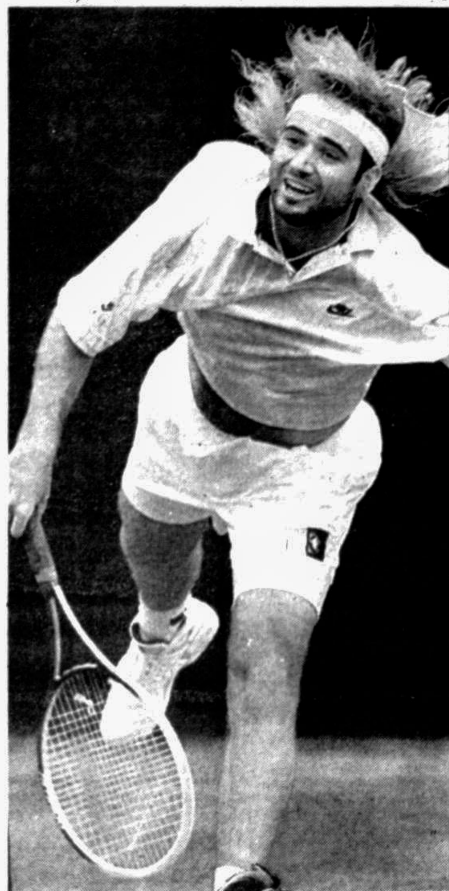
ANDRE AGASSI...first Grand Slam triumph

Ivanisevic took the lead when Agassi sent a running