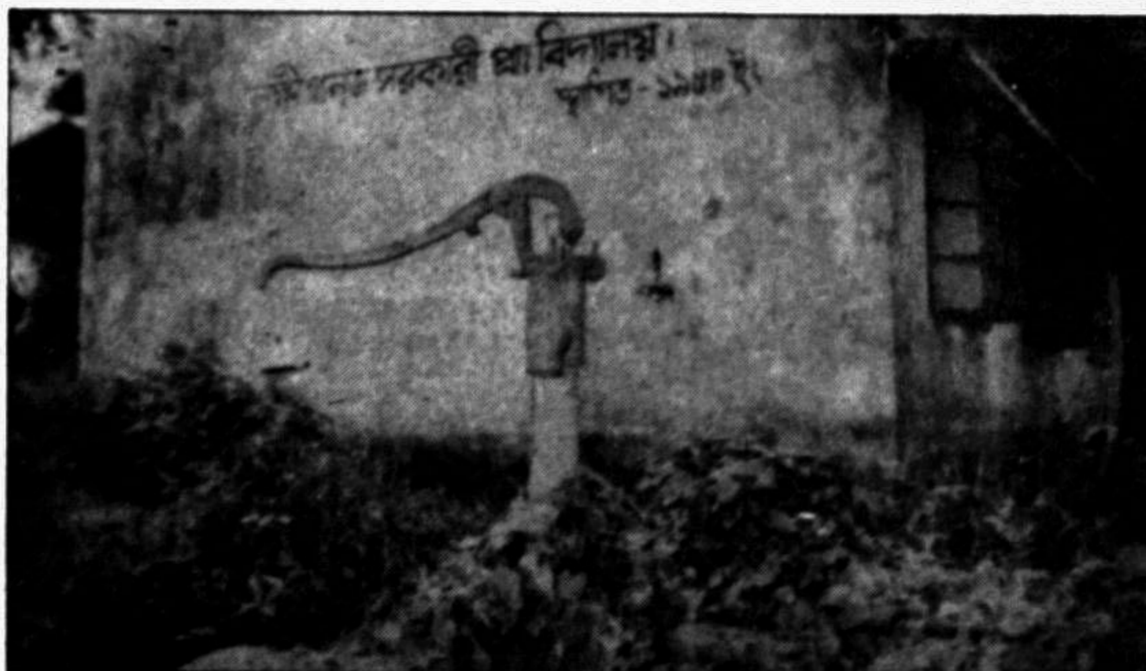
MADARIPUR: The tubewell of the government primary school at village Luxmiganj under Sadar Thana has been lying out of order for a long time. As a result, the teachers and the students have been suffering much for want of drinking water.

The girl had gone to defecate on the railway line early in the morning, they said.