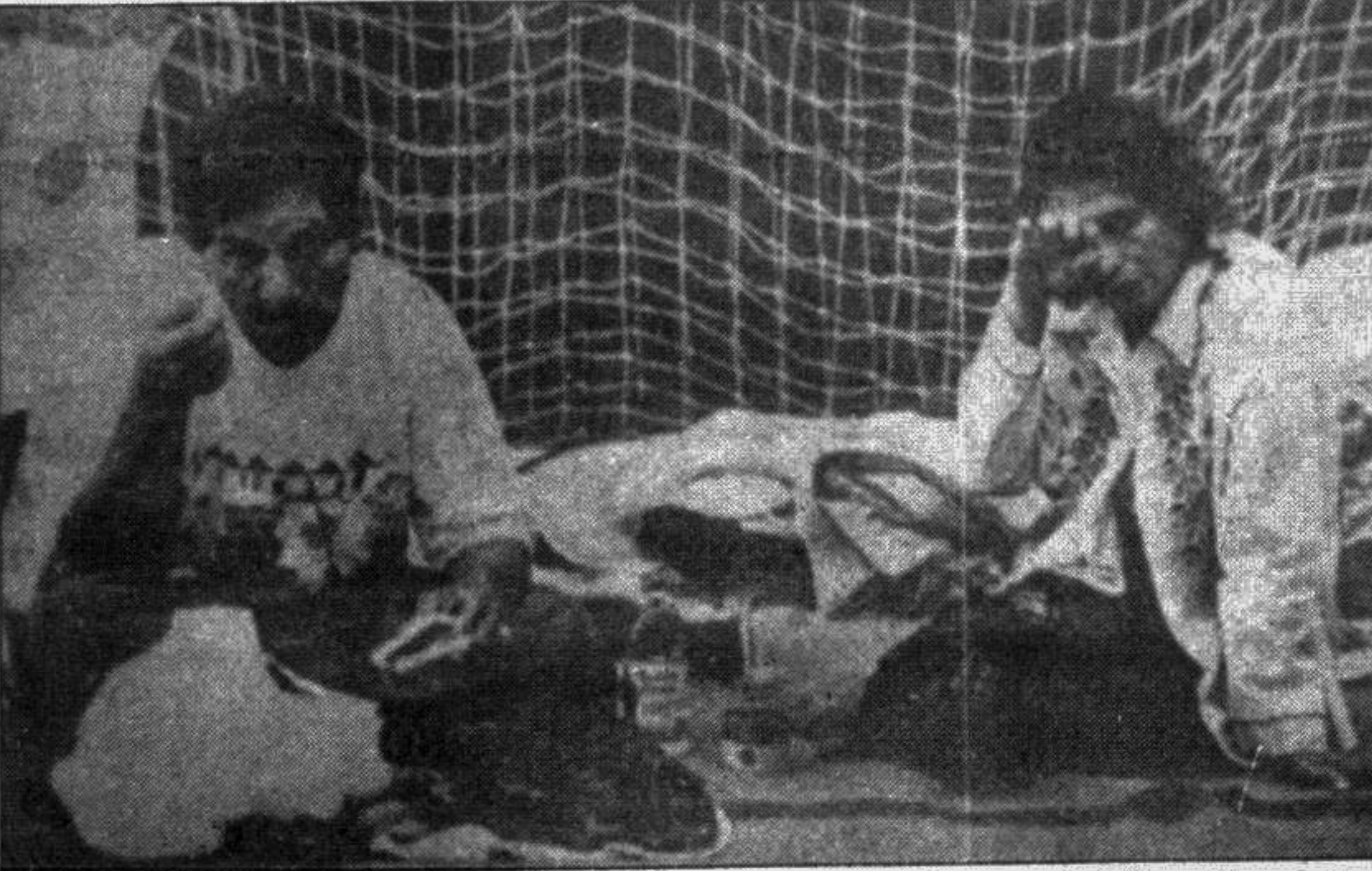
SPLIT, Croatia: A refugee couple from Northern Bosnia, eat their meal while resting on the floor of a sports hall after arriving Friday. In the last few days more than 1,000 refugees arrived in Split.

Bush signs bill to extend unemployment benefits: WASHINGTON, July 4: President Bush on Friday signed a bill giving jobless Americans up to a half-year additional unemployment benefits. The action came one day after the government announced that unemployment had soared to an eight-year high, reports AP.