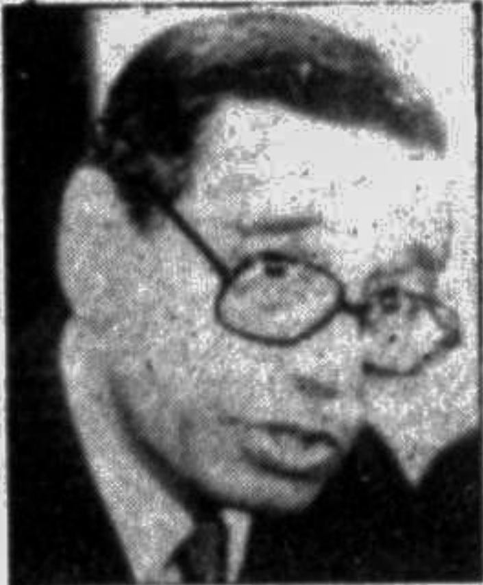
Boutros-Ghali, who met EC envoy Lord Carrington on Thursday to discuss European plans for talks on Yugoslavia, declined to say whether there was any plan for peace enforcement in Yugoslavia should the violence there continue.

LONDON, July 4: UN Secretary General Boutros Boutros-Ghali warned Friday that if the United Nations were to intervene in Yugoslavia, this would correspond to what was done against Iraq in the 1991 Gulf war, reports AFP.