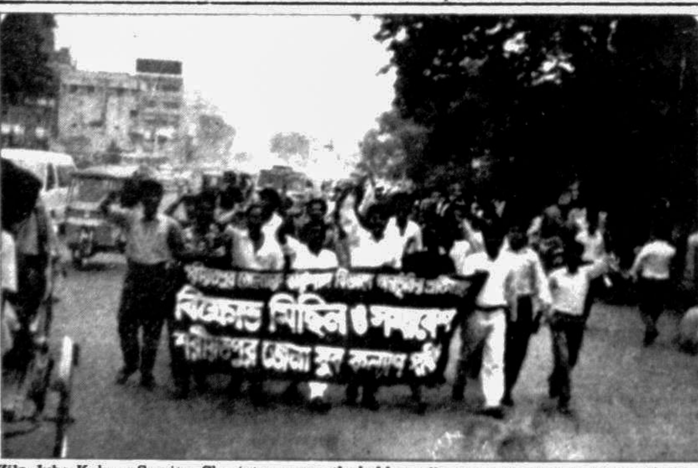
Zila Jubo Kalyan Samity, Shariatpur recently held a rally protesting the inclusion of the district under the proposed Barisal Division.

In his connection, a procession was brought out in main thoroughfares of the town.