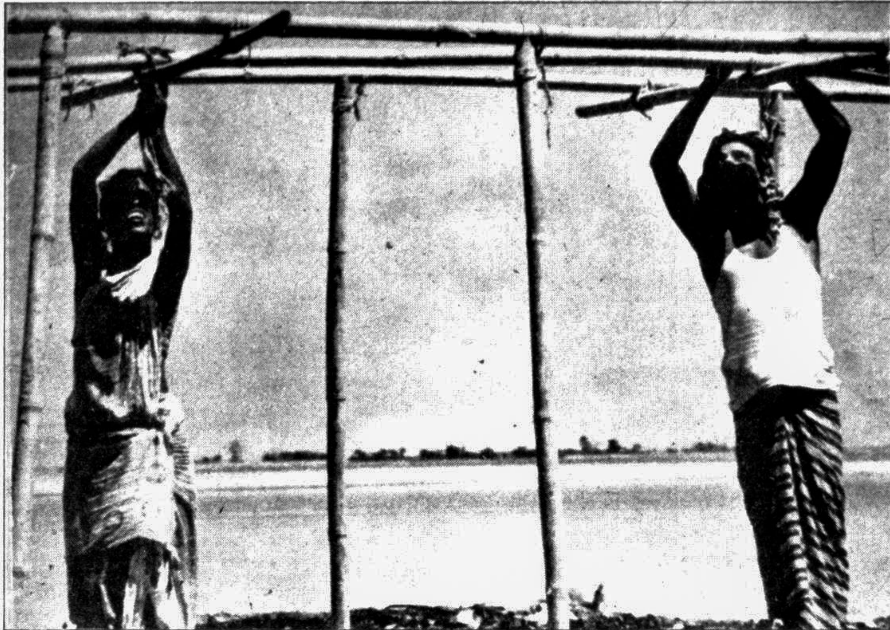
BOGRA: Husband and wife of a erosion-hit family of Shariakandi Upazila are making a shelter on the embankment to live in.