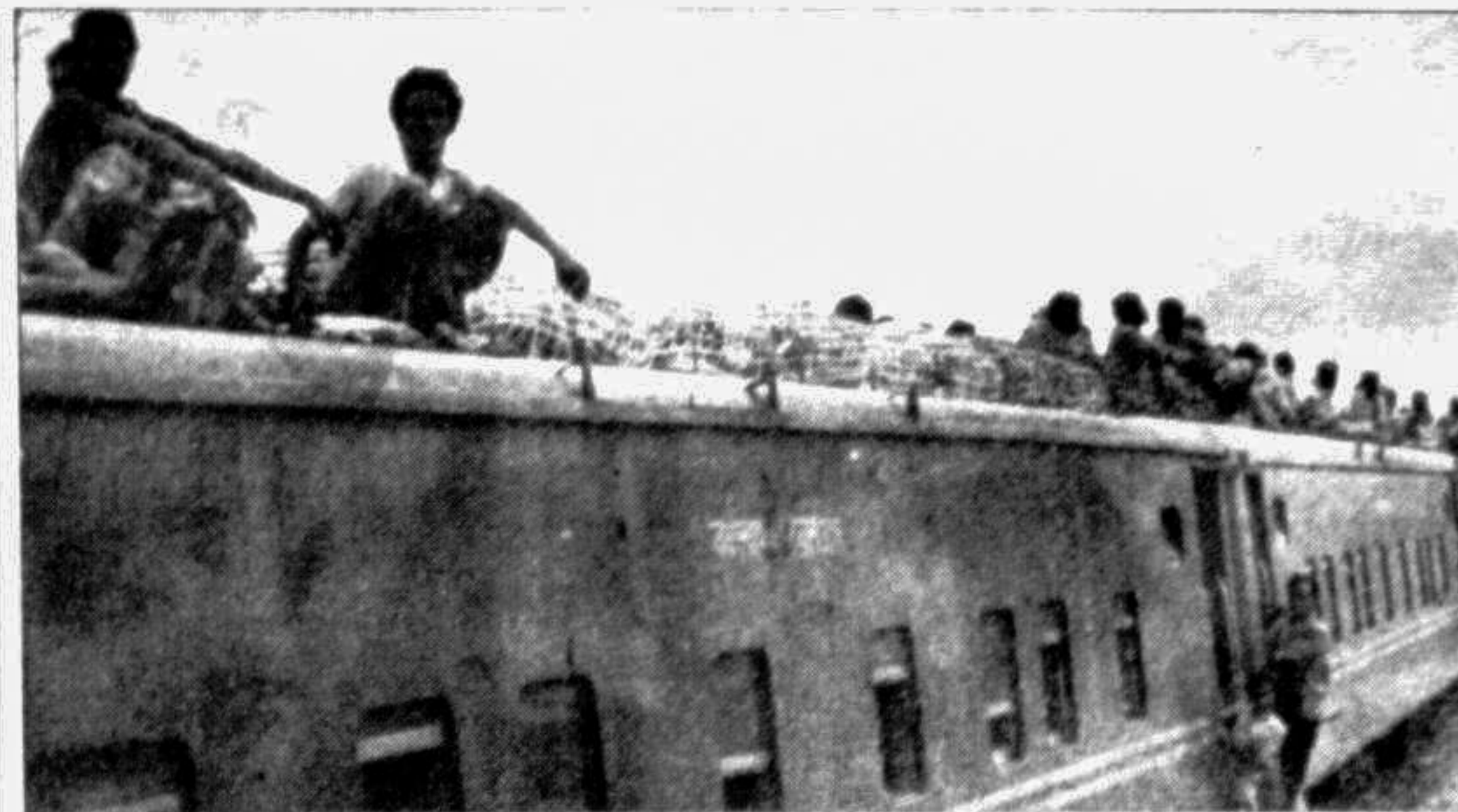
Chickens being carried on the train-tops to the capital due to the transport strike.