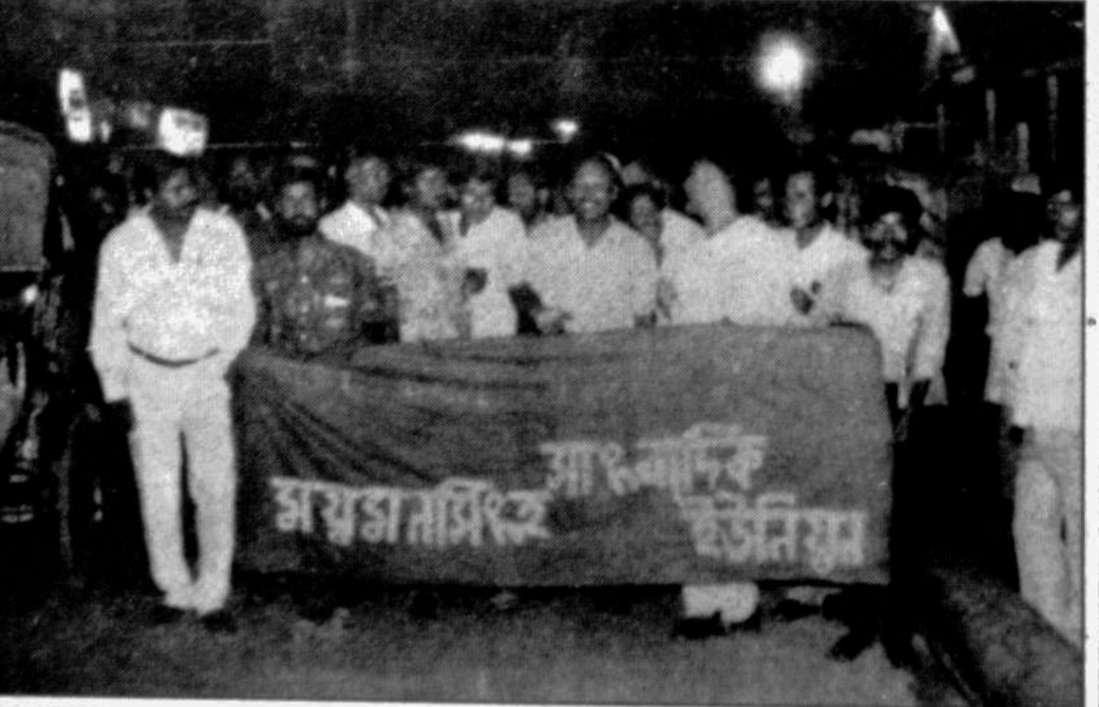
MYMENSINGH: Mymensingh Union of Journalists brought out a procession here recently condemning the police action on journalists at National Press Club on June 21.