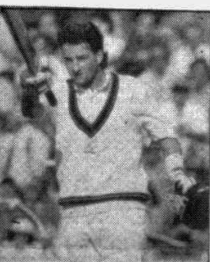
MARK WAUGH ...219