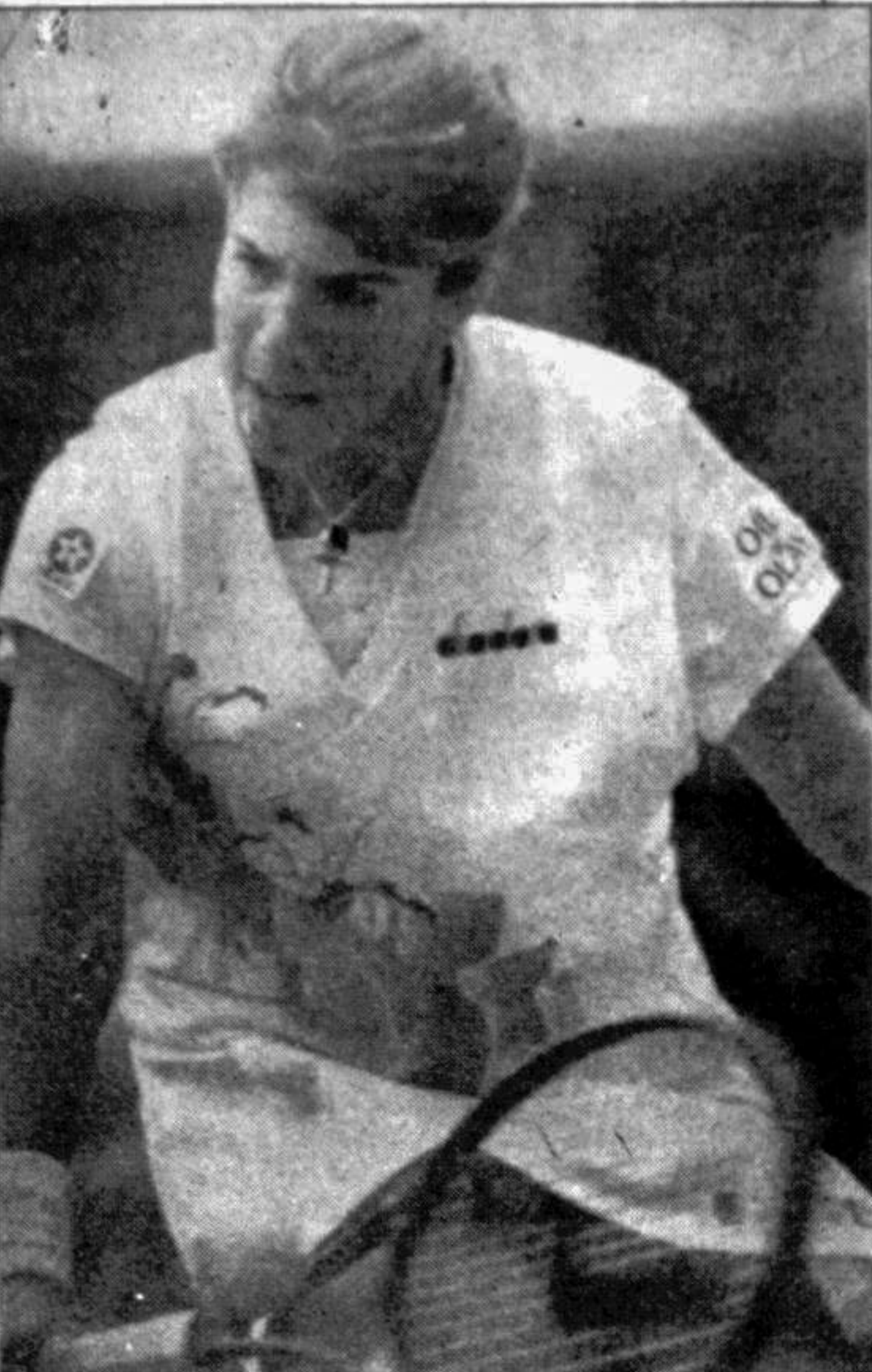
American's Jennifer Capriati in action during her women's singles second round match against fellow-countrywoman Pam Shriver on Centre Court at the Wimbledon Tennis Championship on Thursday.