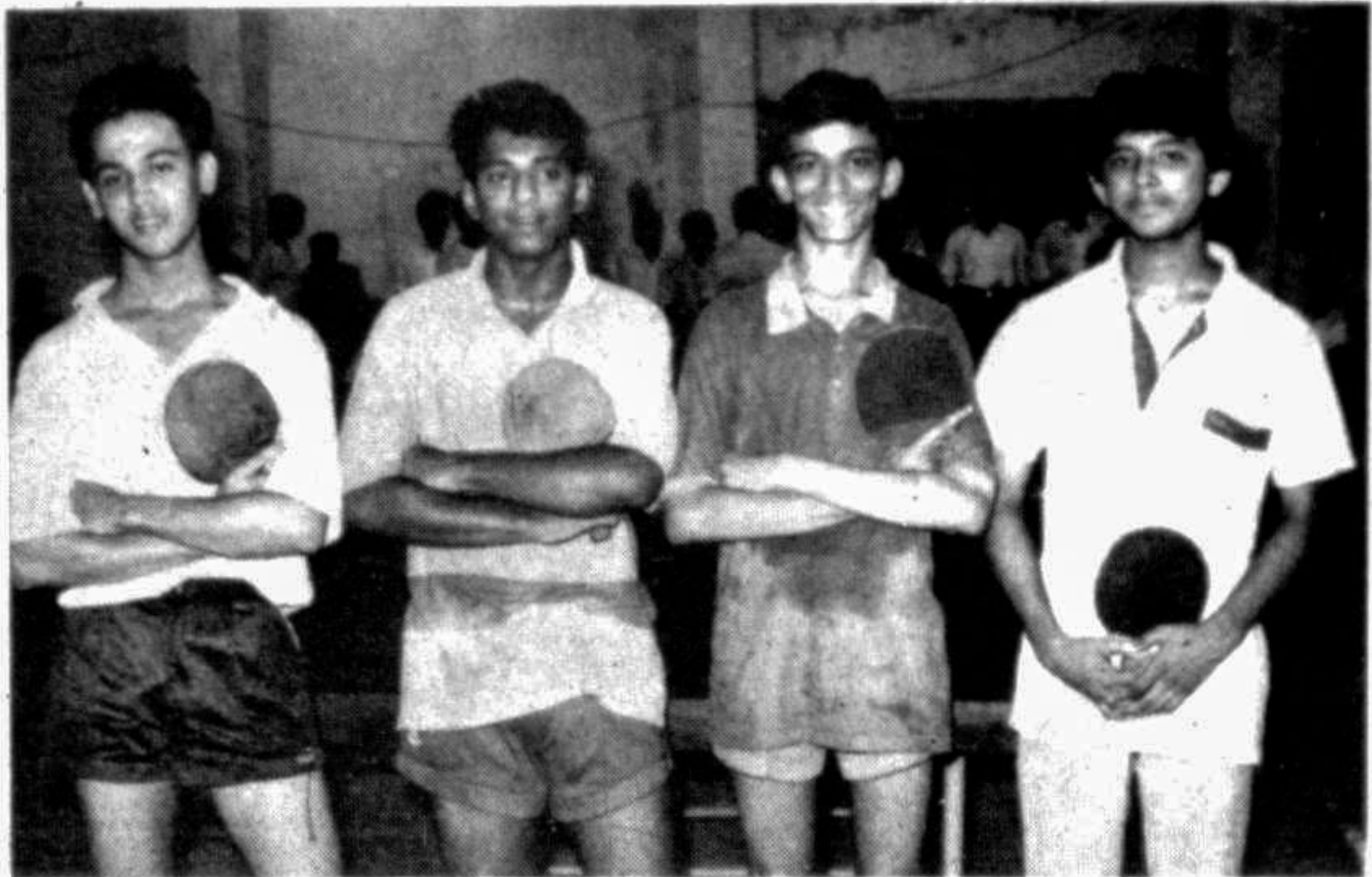
The Dhaka DSA boys who won the team title of the Green Delta table tennis tournament at the National Coaching Centre yesterday.

Earlier, in the semifinals of the boys' team event yesterday, Narail made short work of Govt Laboratory School of Dhaka with three to one set victory