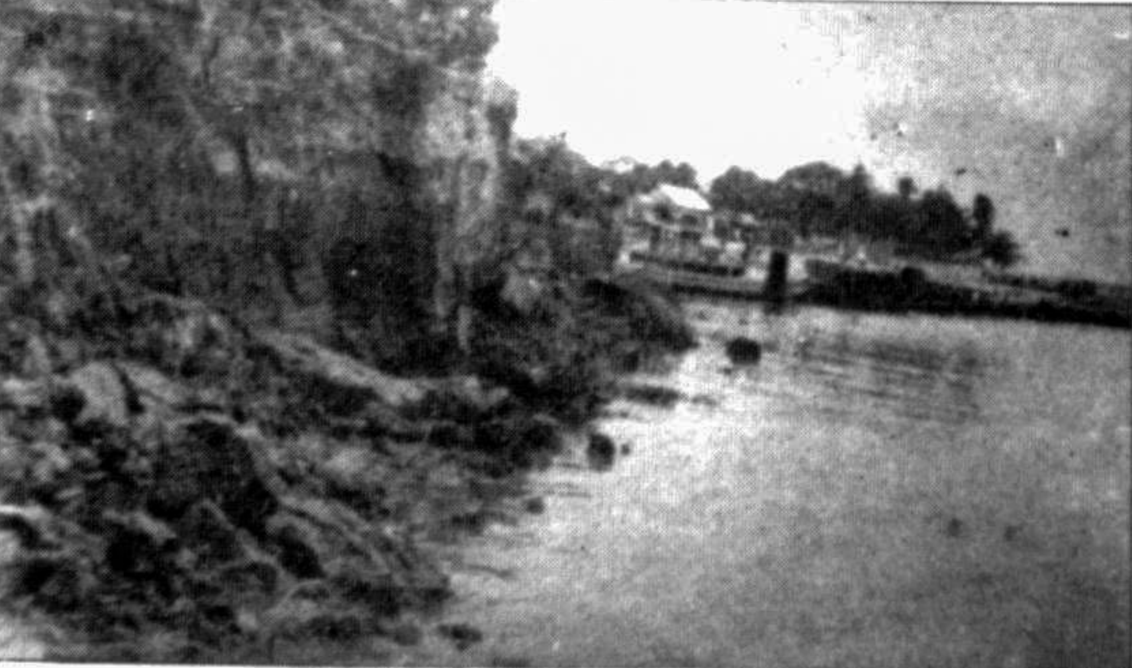
MADARIPUR: A scene of erosion-hit area, Kalatala of the town.

Construction materials' prices shot up MANIKGANJ, June 24: Sudden price hike of construction materials like cement, rod and bitumin emulsion in different parts of the district have been hampering development work over the last three weeks, reports UNB. Prices of Bangladesh Tobacco Company's (BTC) different brand of cigarettes have shot up in the local markets over the last few days. According to market sources, Gold Leaf and Filter Capstan brands are being sold at Taka 50 per packet as against Taka 38 and 27 respectively. Besides, Triple Five (555) brand is being sold at Taka 65 per packet as against Taka 43, the sources said. It may be mentioned that BTC resumed production after a brief stopped due to some unavoidable reasons following the labour unrest. While taking to UNB, a BTC official said the present the supply in the market is quite normal but some dishonest dealers are responsible for the artificial scarcity of the cigarettes in the markets.