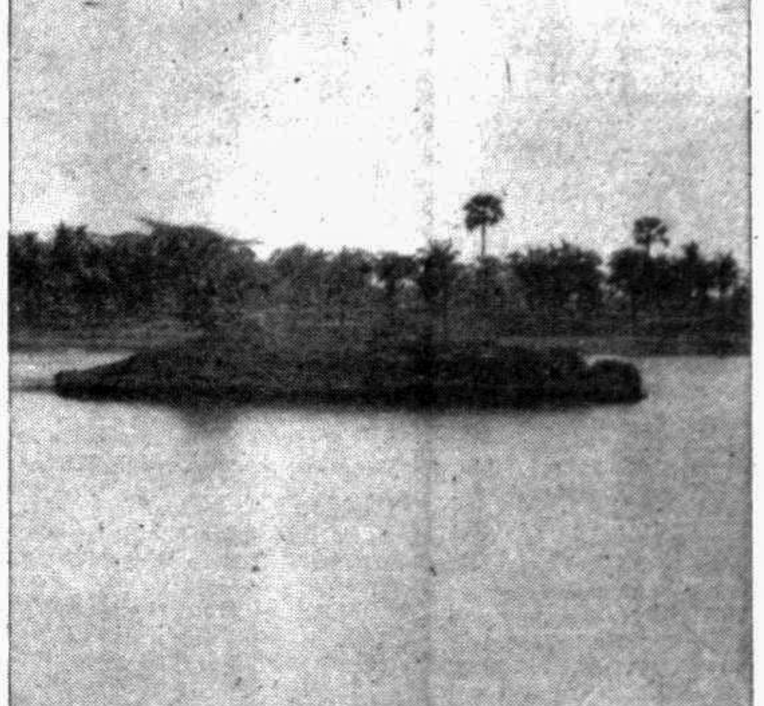
BARISAL: A view of the Durgasagar Dighi.

dighi. Lakhs of people from Mithila, Drabir, Karnataka, Bhatpara, Nabadweep, Kashi, Agra and other places of the subcontinent joined with the local people in the celebration. All invites including Brahmins and Pandits of Chandradwep and other places were entertained for a month in Madhabpasa. After the liberation was in 1972 then the government re-excavated Durgasagar Dighi creating a little green island amid the water, where now thousands of migratory birds find a loving sanctuary. This island was created to make the dighi more attractive to the tourists. The fishery department has undertaken some programmes to attract the anglers to the place. But, unfortunately, all these programme were halted on the midway with nothing achieved. The "Durgasagar Dighi" is still beautiful with all of its natural beauty, with the chirping of thousands of migratory birds on its dark green island amid the vast dighi.