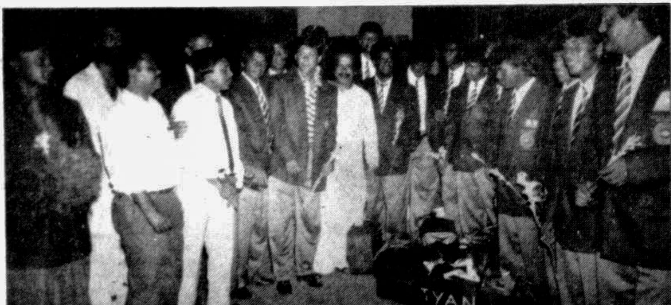
The Bangladesh cricket team which retained the South East Asian championship was received by BCCB officials on their return from Singapore Monday.

The goods included footballs, handballs, volleyballs, badminton sets, cricket sets, hockey sets, table tennis sets and carrom boards.