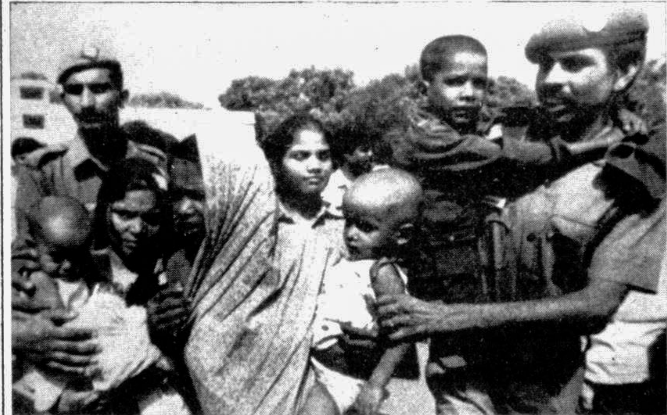
Indian police carrying Bangladeshi children Monday in New Delhi after unearthing a racket involving selling of children in Dubai for illegal use in desert camel race, there. In the race, the children's cries are said to spur the beasts to run faster.

Information Minister Nazmul Huda, Health and Family Welfare Minister Chowdhury Kamal Ibne Yusuf, Works Minister Rafiqul Islam Mian were present.