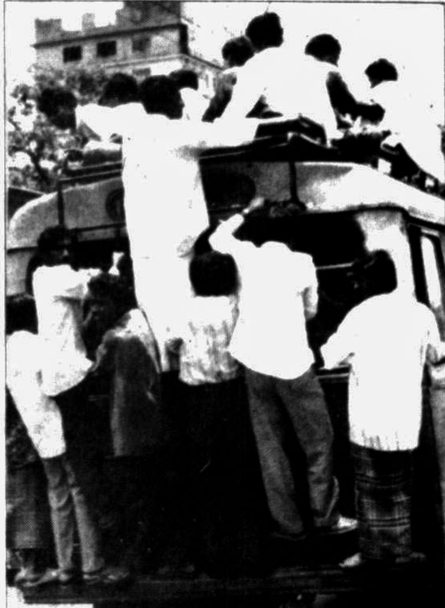
Office goes travelling on BRTC buses in the city yesterday risking their lives, as public transports were off the road due to transport strike.