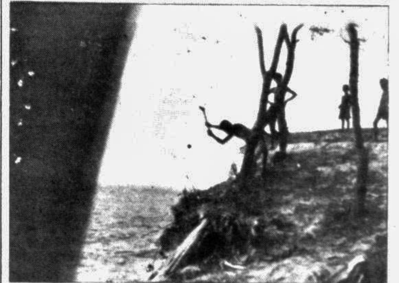
RAJBARI: The erosion of the river Madhumati at Madhukhali Upazila. Over 100 families were rendered homeless recently.

District Judge Azizul Hoque delivered the judgement after examining the evidence and records.