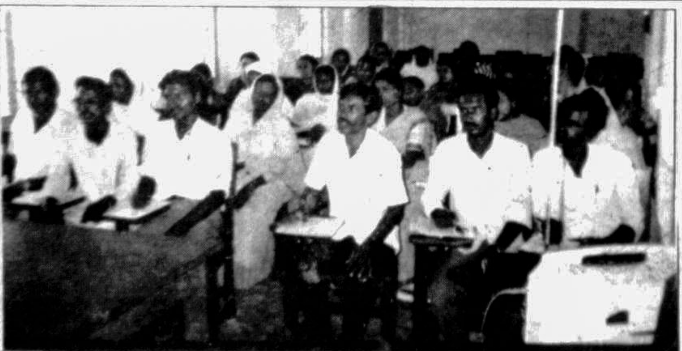
SYLHET: The audience at a family planning workshop held here recently.