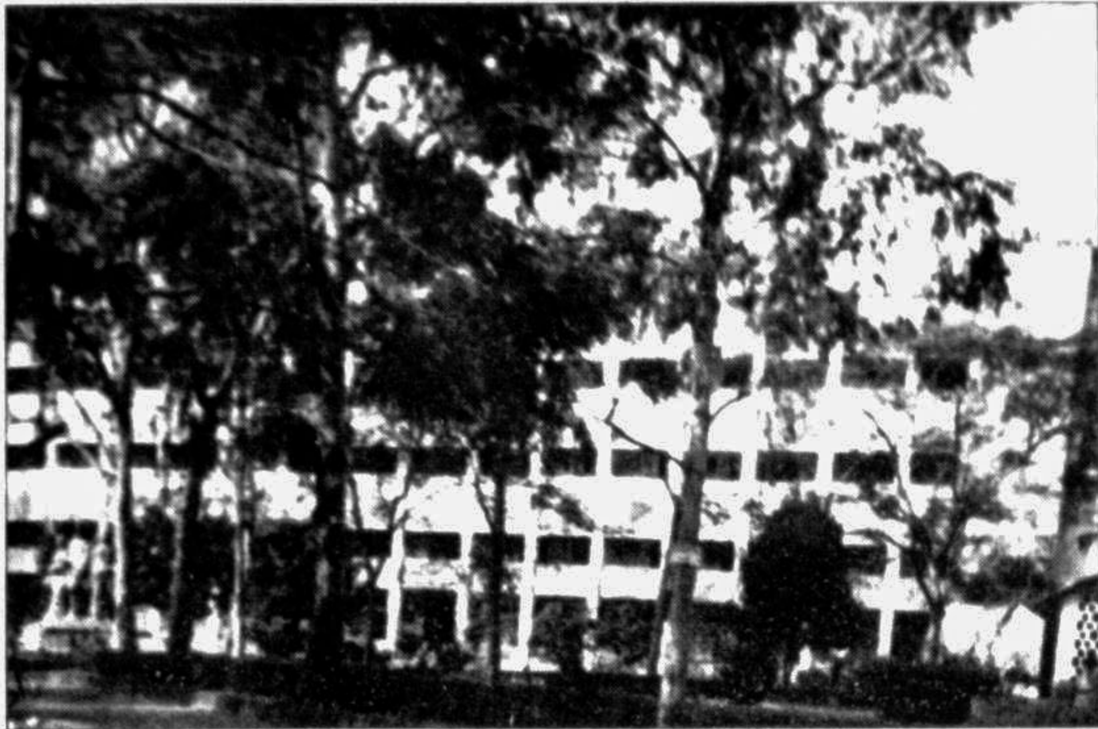
Dhaka University campus where foreign students come with great hope.

There is a general belief that Bangladesh does not have a high quality higher education system. Despite that unhelpful perception, students from around 10 countries are currently studying at Dhaka University and its constituent institutions.