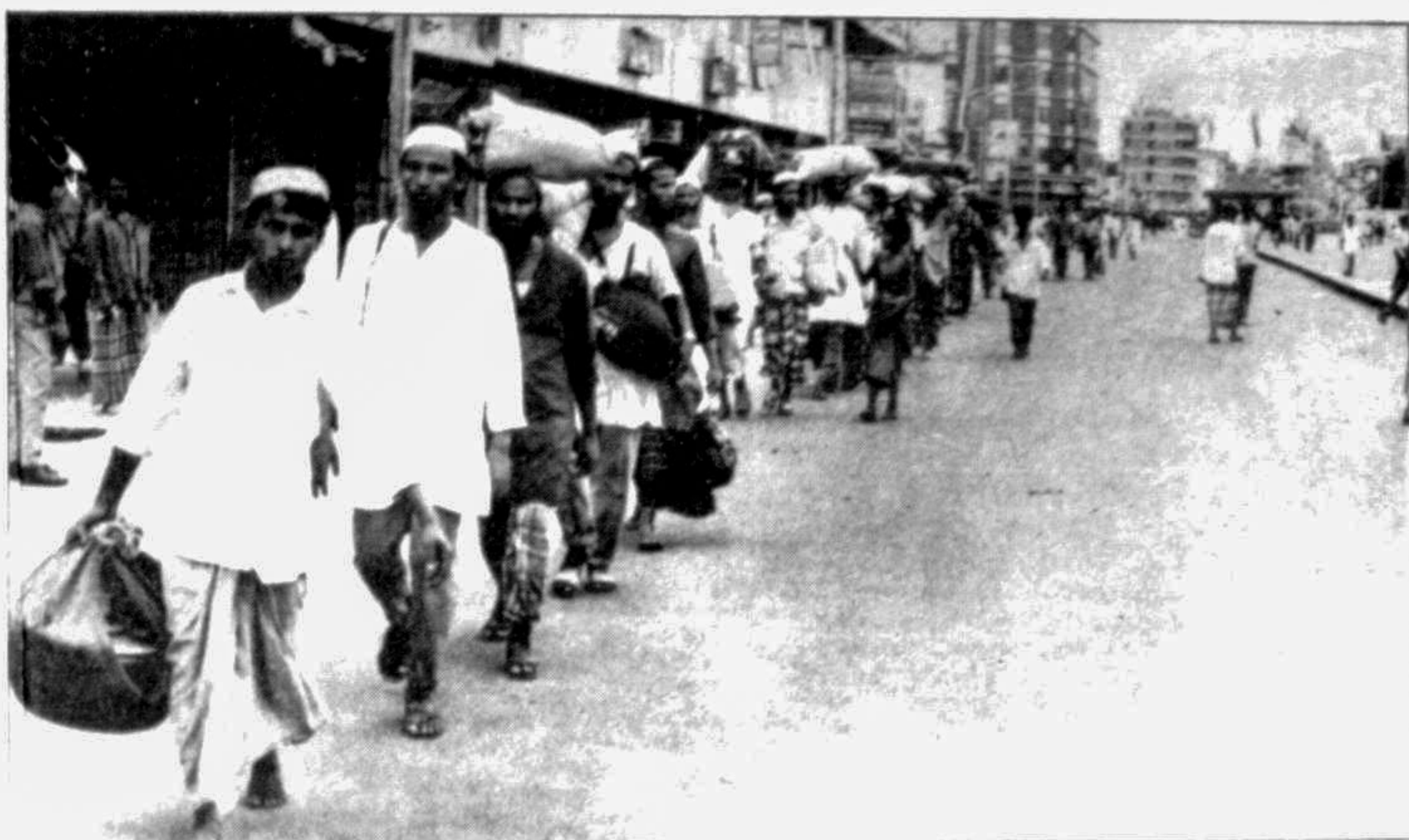
Dhaka city during hartal hours yesterday.