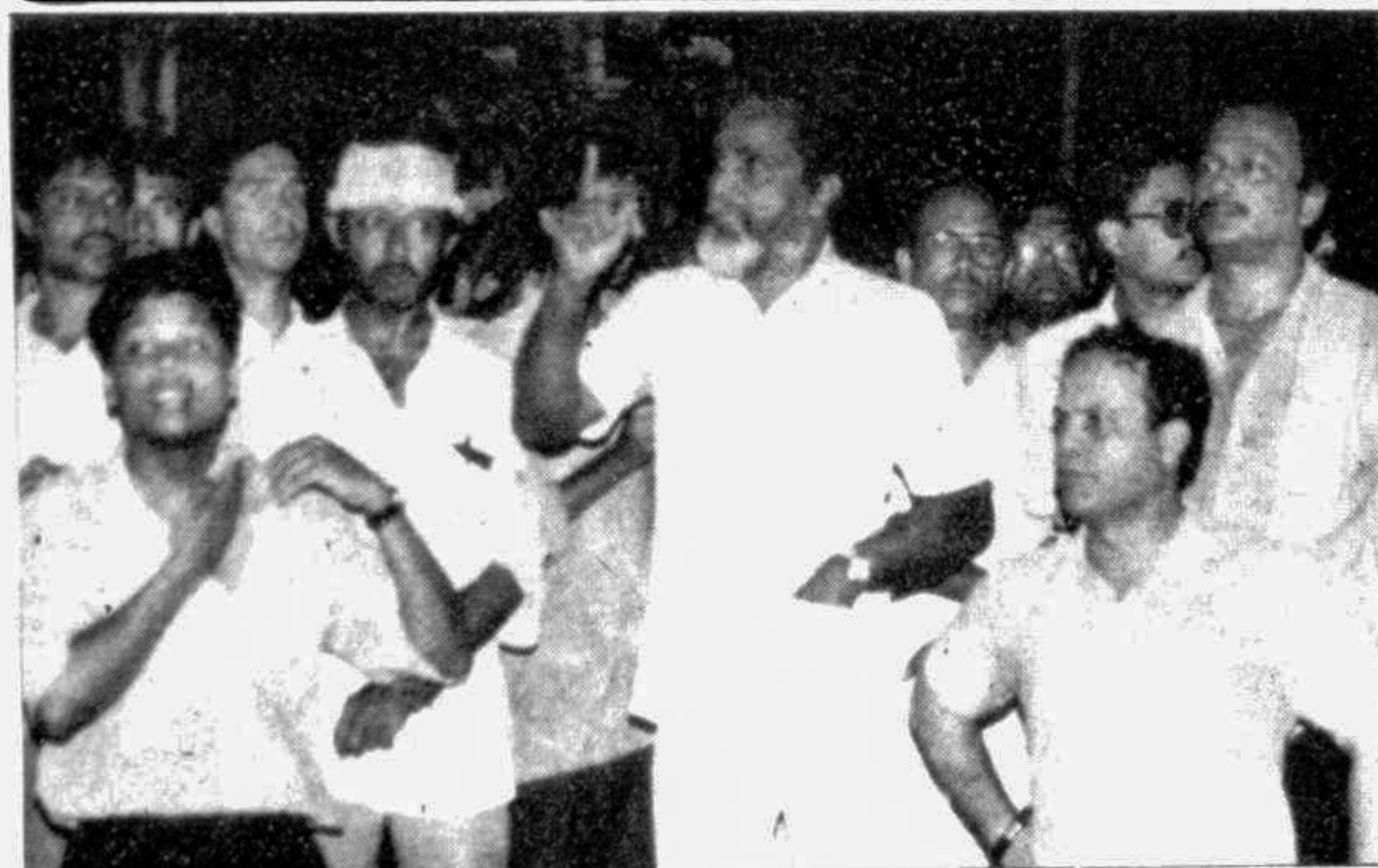
Journalist leaders protesting police attack on them.

Not only that, an African student said he believed the quality of education in Bangladesh was somehow better than in his own country.