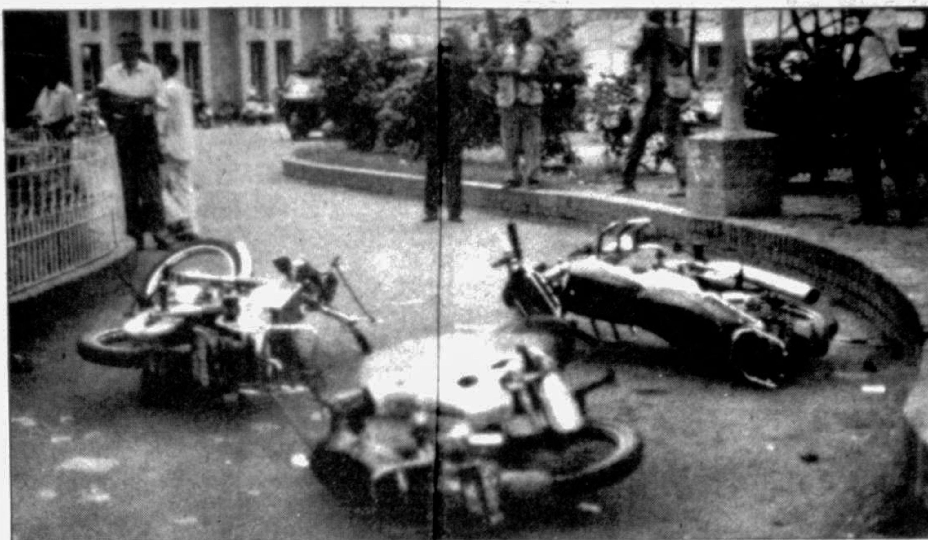
Newsman's motorbikes damaged by the police in Press Club premises yesterday. One of these belongs to Daily Star

The Education Minister was addressing a gathering of teachers organised by National Federation of Teachers' Association (NFTA) at a city hotel here last night.