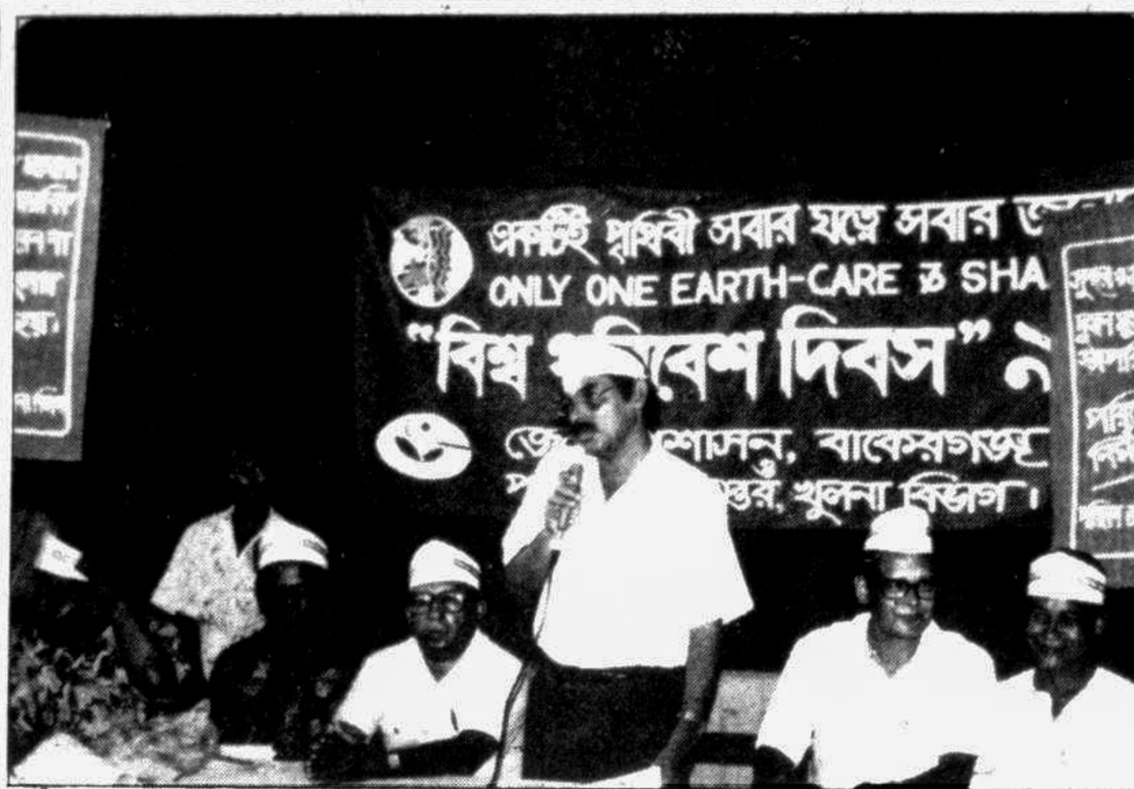
BARISAL: A discussion meeting was arranged here in observance of the World Environment Day. A speaker is seen speaking on the occasion.

When contacted an official of the pourasava who is acting in the office for interim period told that they have no power to consider the tax rate, because it was settled by the elected representatives. Thus they issued gentlemen notice to meet the fund crisis.