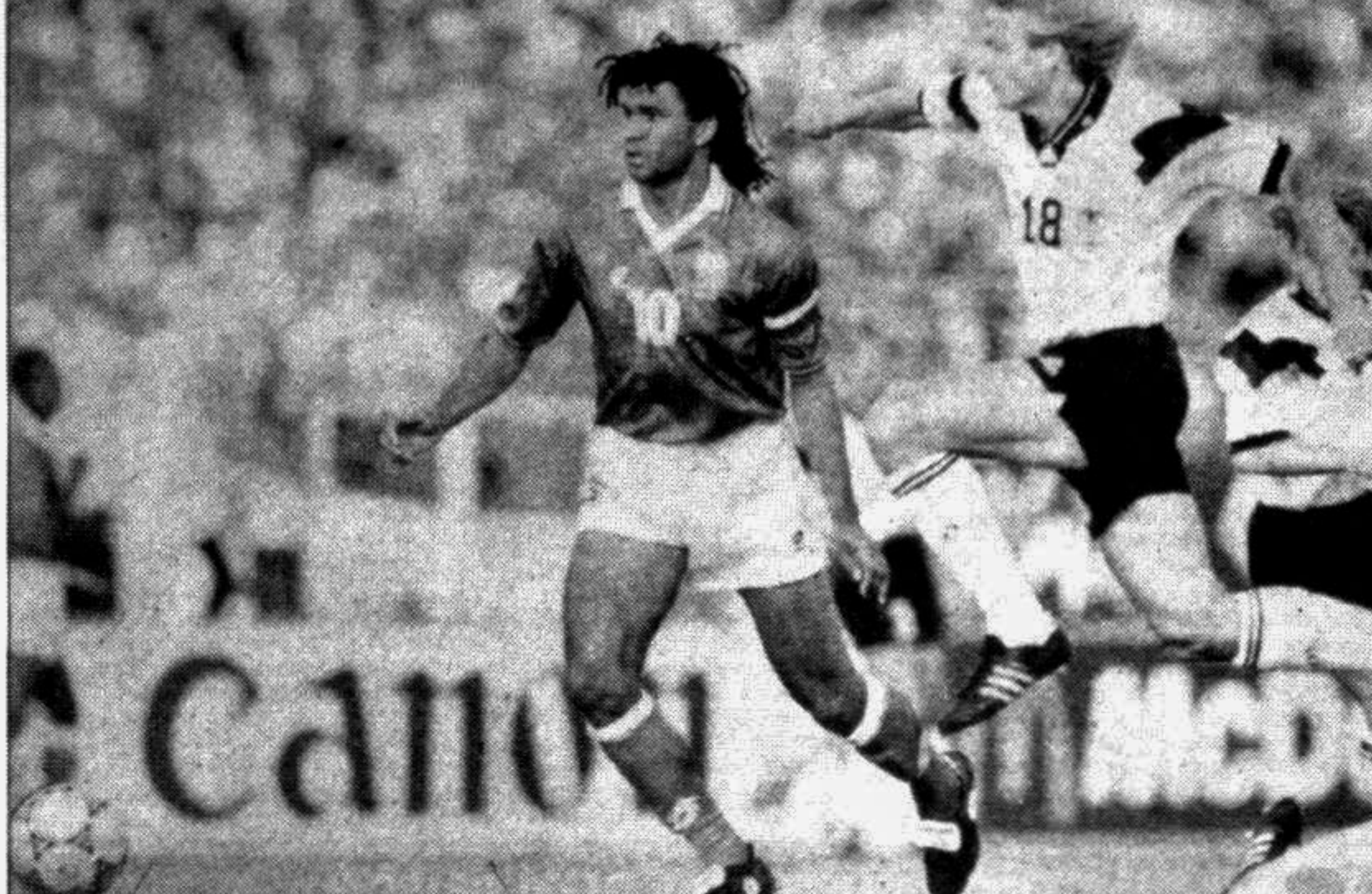
German striker Juergen Klinsmann tries to shoot past Dutch captain Ruud Gullit in Thursday night's European Championship soccer match at Goteborg, Sweden.

"I can't say what the side will be to play Sweden but I hope we can play Holland again," he said.