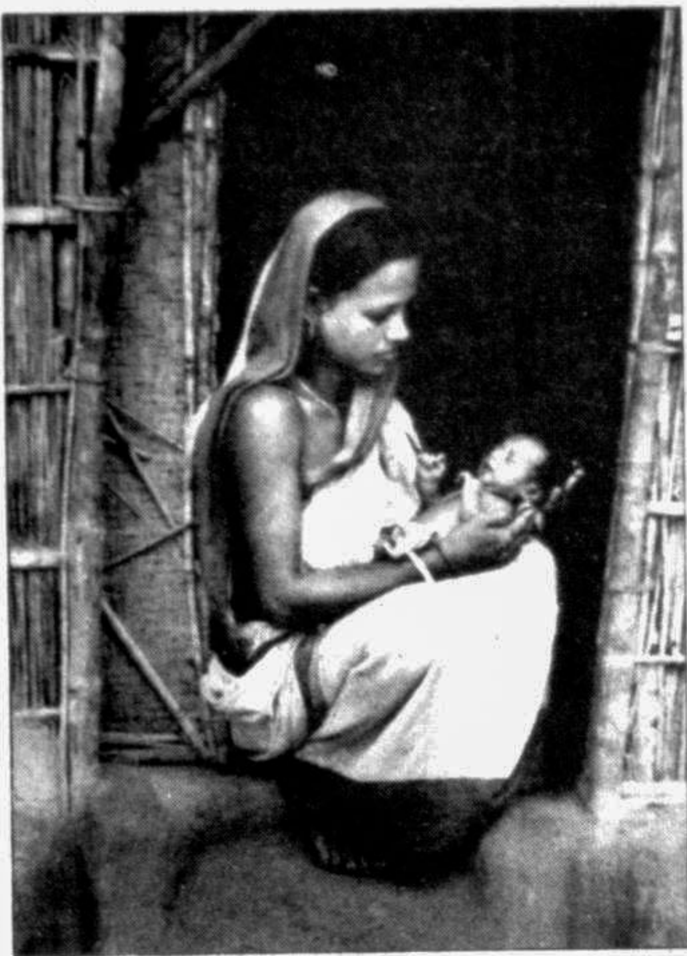
One of the many Rahimas in our country.

I am quite certain that there are many Rahimas working in well-to-do households who have a story to tell.