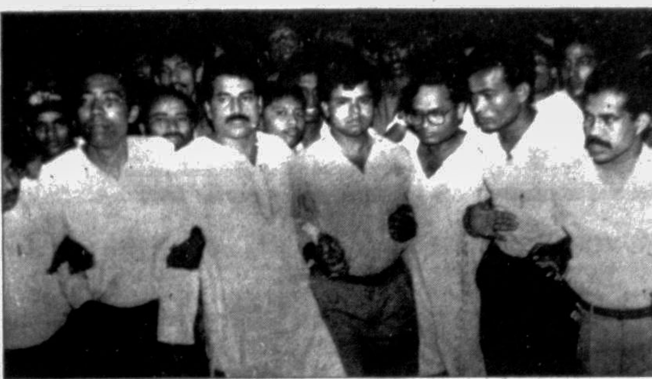
A procession of Jatiyatabadi Chhatra Dal in the city yesterday (Thursday) in support of Budget '92-93.