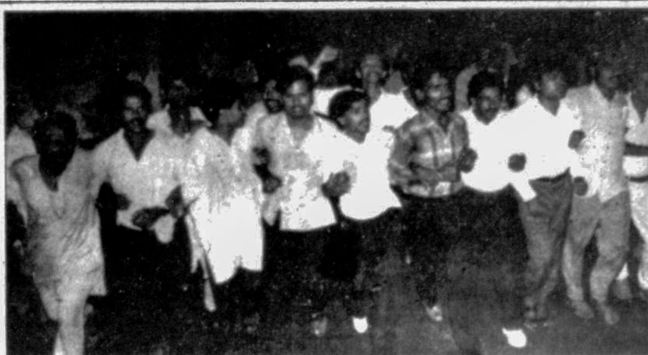
A demonstration of Bangladesh Chhatra League (M-I) in front of the National Press Club yesterday (Thursday) in protest against Budget '92-93.