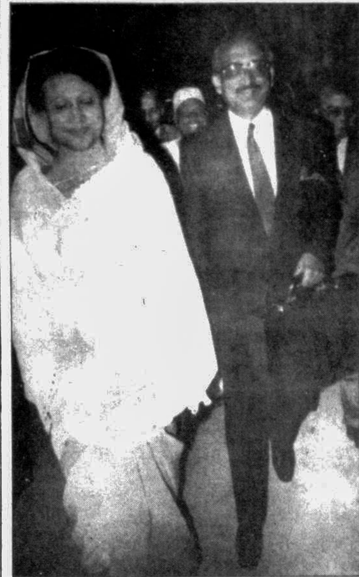
Prime Minister Begum Khaleida Zia leading her Finance Minister and other Cabinet colleagues to the House prior to the budget session yesterday.

Finance Minister M Saifur Rahman yesterday announced Tk 18286.33 crore budget for 1992-93 with an overall deficit of Tk 7732.33 crore. Revenue income for the next financial year has been estimated at Tk 10,554 crore of which Tk 8550 crore would be expenditure. The Tk 2004 crore surplus would be spent to finance a part of the Annual Development Programme (ADP) of Tk 8650 crore. The rest would be met from foreign assistance and loans.