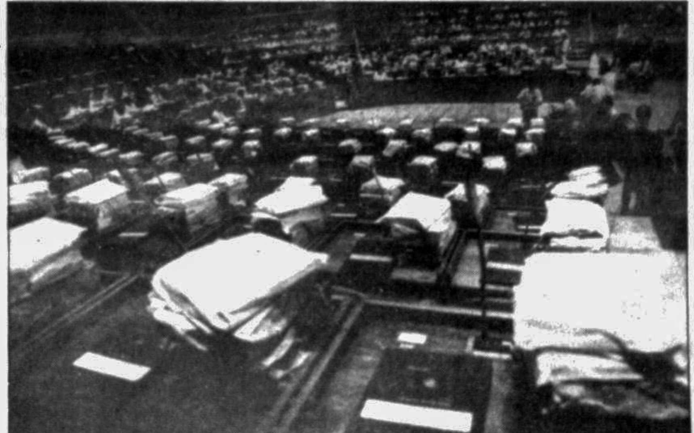
Empty seats of the Opposition members in the House during Finance Minister's budget speech.

Also, the Finance Minister proposed duty rebates of Tk 344 crore but expanded the tax net and reforms in revenue collection to earn a net amount of Tk 450 crore. Only Taka 140 would be realised through new tax measures. Attired in a dark suit with a red tie the Finance Minister entered the House to place the budget. He carried the budget documents in the new Taka 3500 black briefcase. The presentation of the budget was delayed by 20 minutes from the schedule announced earlier.