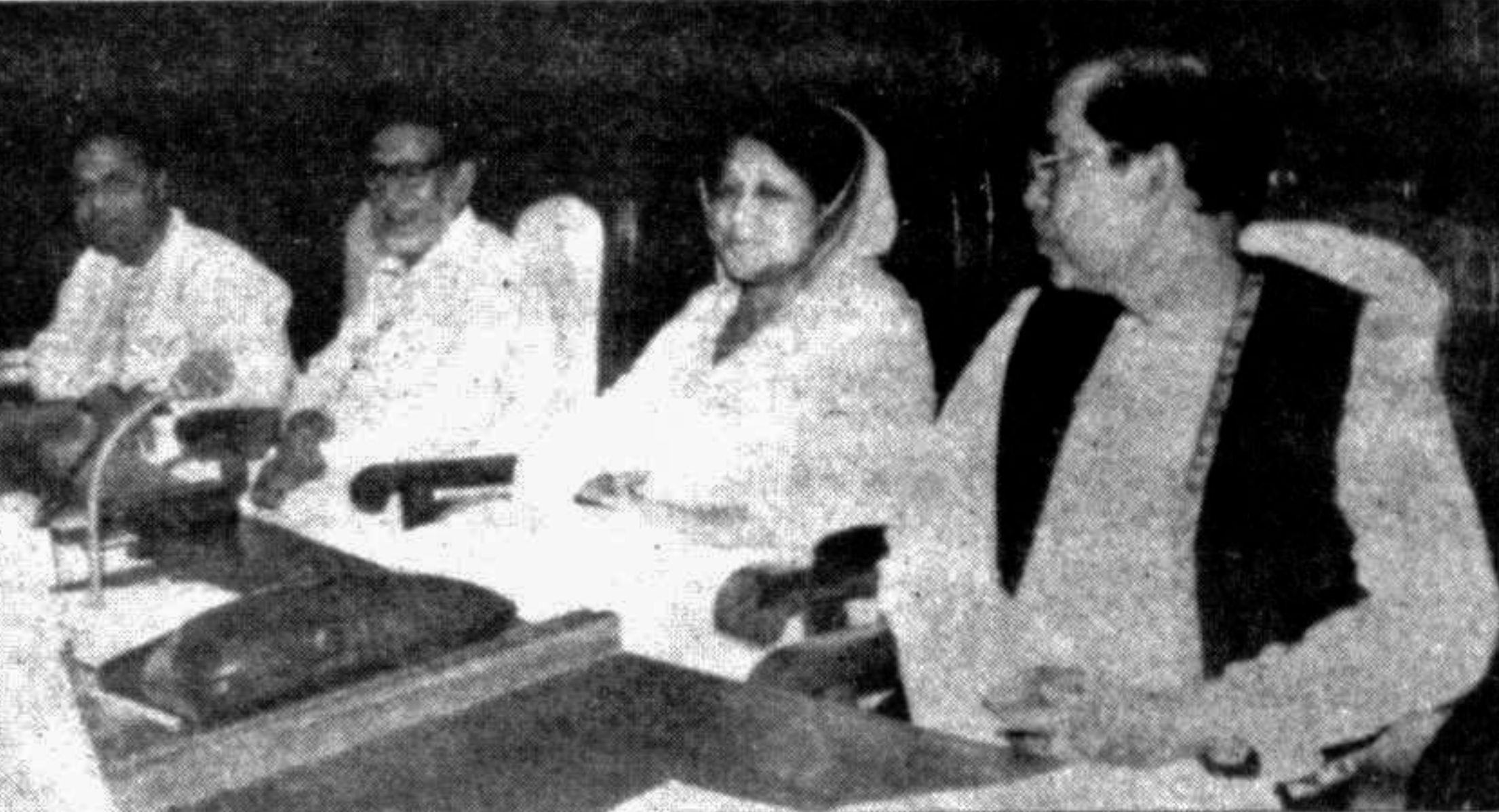
Prime Minister Begum Khaleda Zia presiding over the meeting of BNP Parliamentary Party at Sangsad Bhaban yesterday.