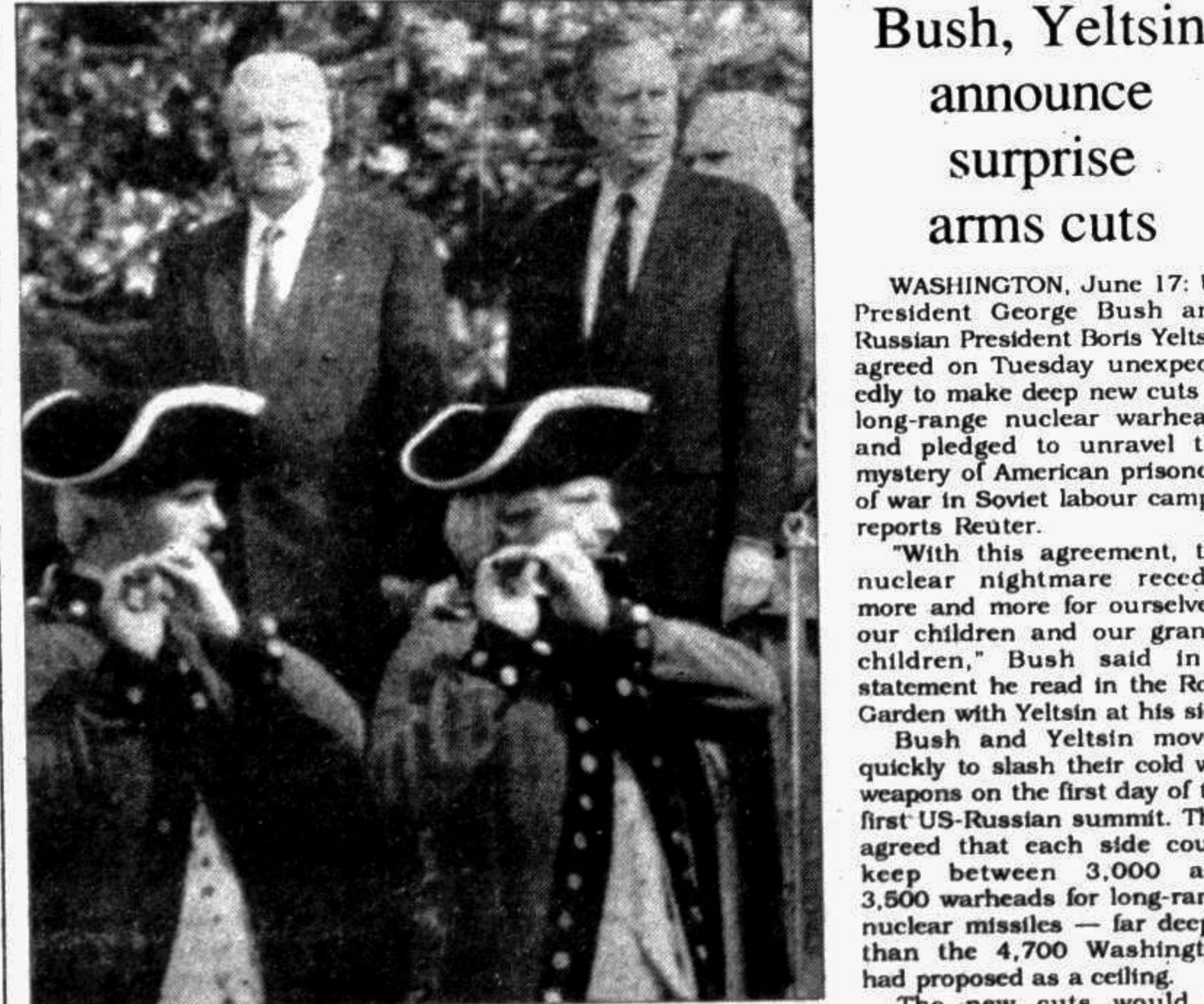
US President George Bush (R) and Russian President Boris Yeltsin watch members of a ceremonial honour guard pass in review on Tuesday on the White House's South Lawn.