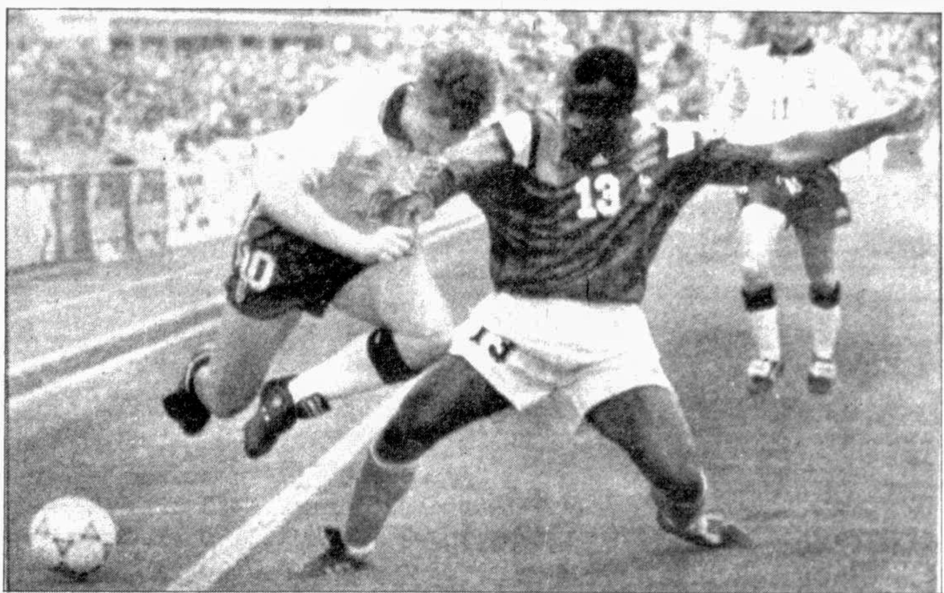
French defender Basile Boli tackles English striker Gary Lineker (L) during the European Championship Group One match in Malmo Sunday. The match ended goalless.