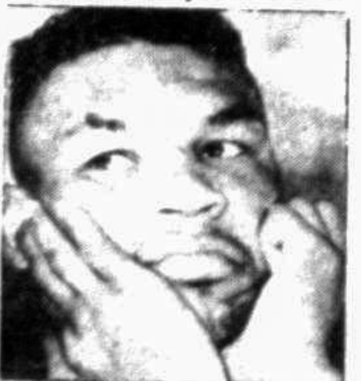
TYSON...end of career?

NEW YORK, June 15: Mike Tyson says he doesn't miss boxing, but he reportedly has told an interviewer he fears his career in the ring may be over, reports AP. "I may never box again," Tyson is quoted as saying in an interview with CBS-TV, reported in Monday's editions of