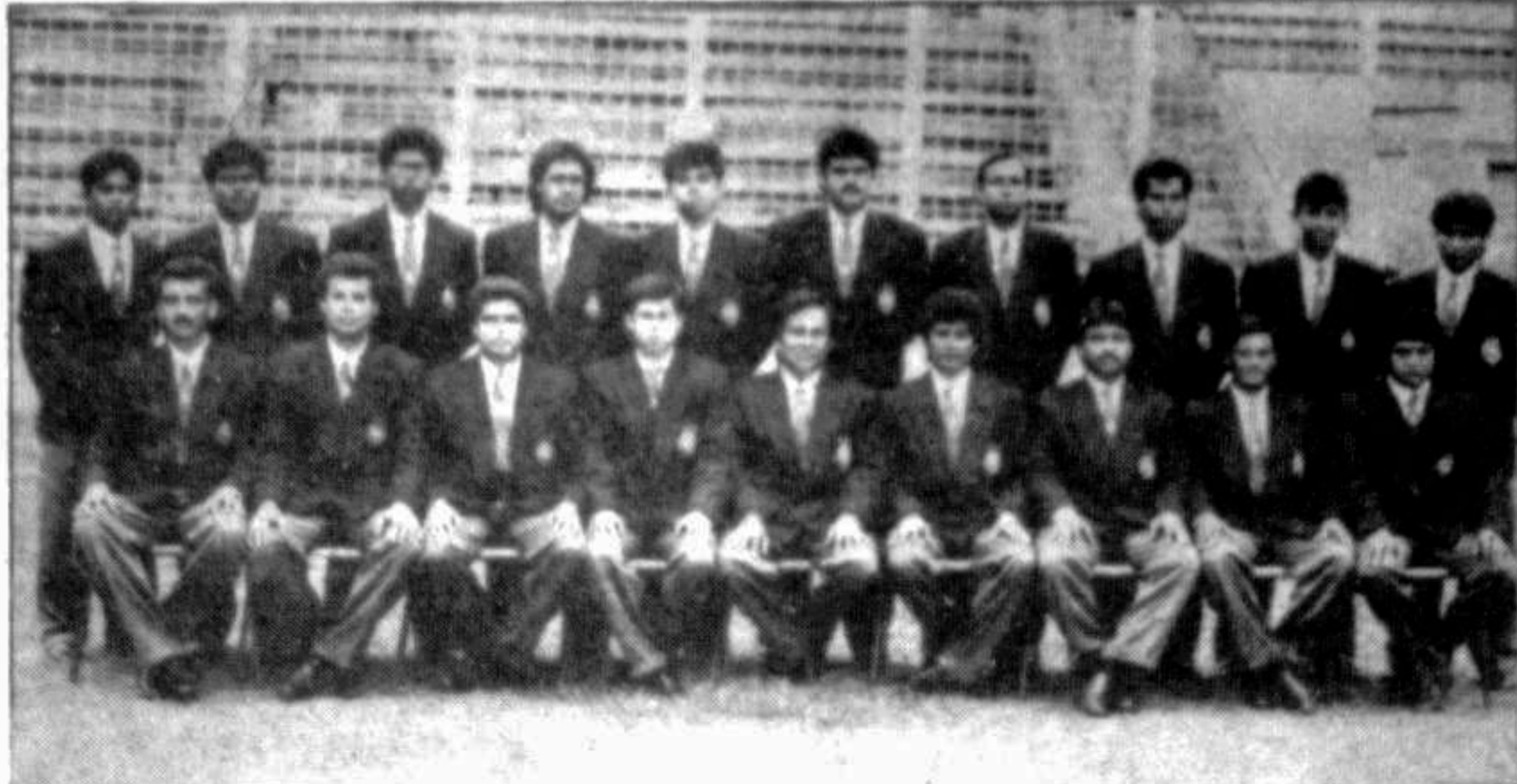
The Bangladesh cricket team which leaves for Singapore today to take part in the South East Asian ICC Associate Members' Trophy beginning there June 15.