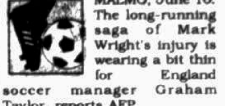
MALMO, June 10: The long-running saga of Mark Wright's injury is wearing a bit thin for England soccer manager Graham Taylor, reports AFP.

"I've got 19 other players here to think about. England are trying to prepare hopefully to win the European Championship," Taylor said when the subject of Wright's Achilles tendon was raised yet again on Tuesday.