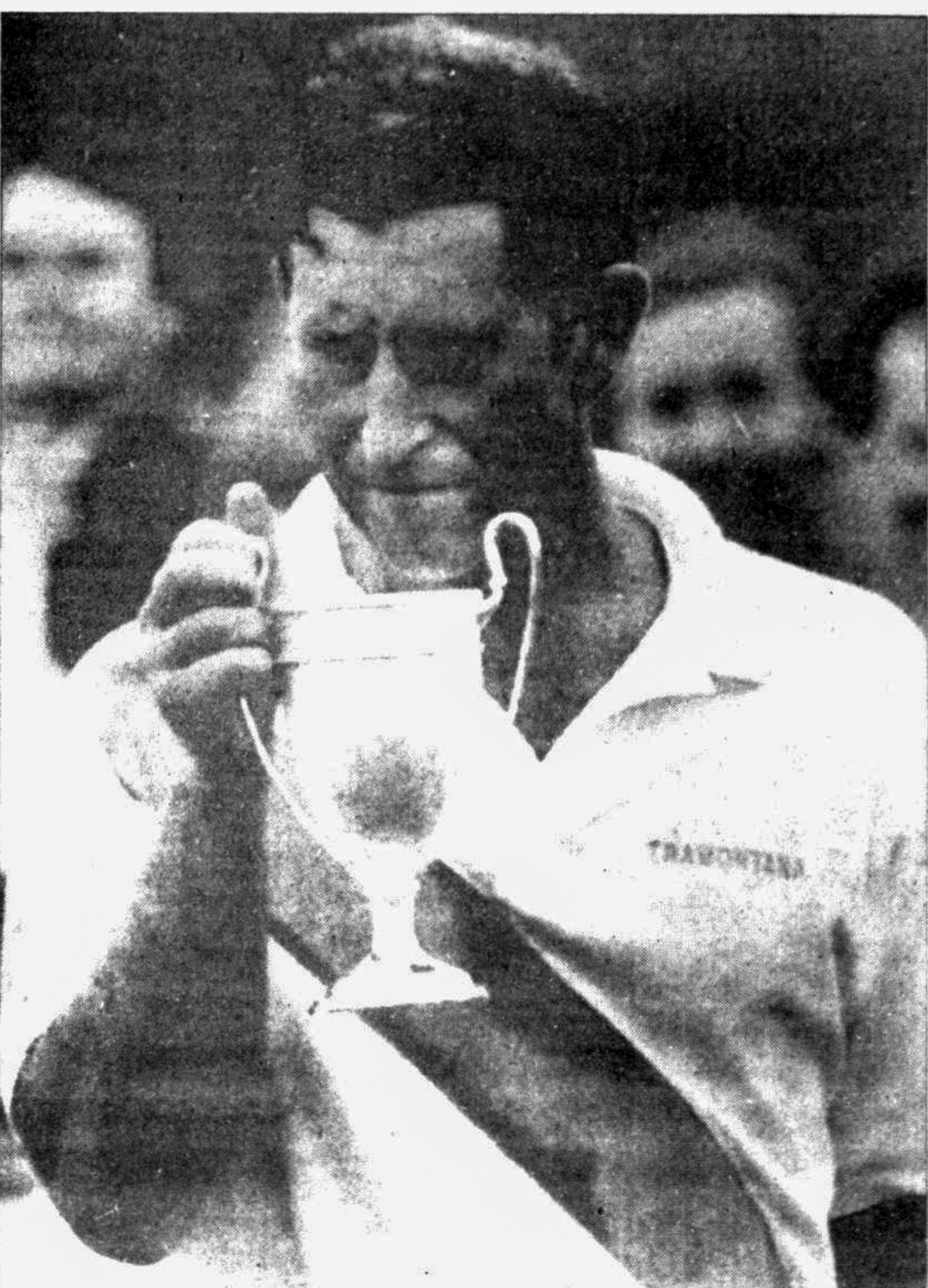
Prince Charles takes a drink from a cup at the Guards Polo Club in Windsor, England during the Dunhill Queen's Cup June 8 as speculation continued about a rift in his marriage to Diana.

The record entry for the Open was 1,707 in 1990. The club said 189 amateurs and 1,477 professionals had entered this year's tournament.