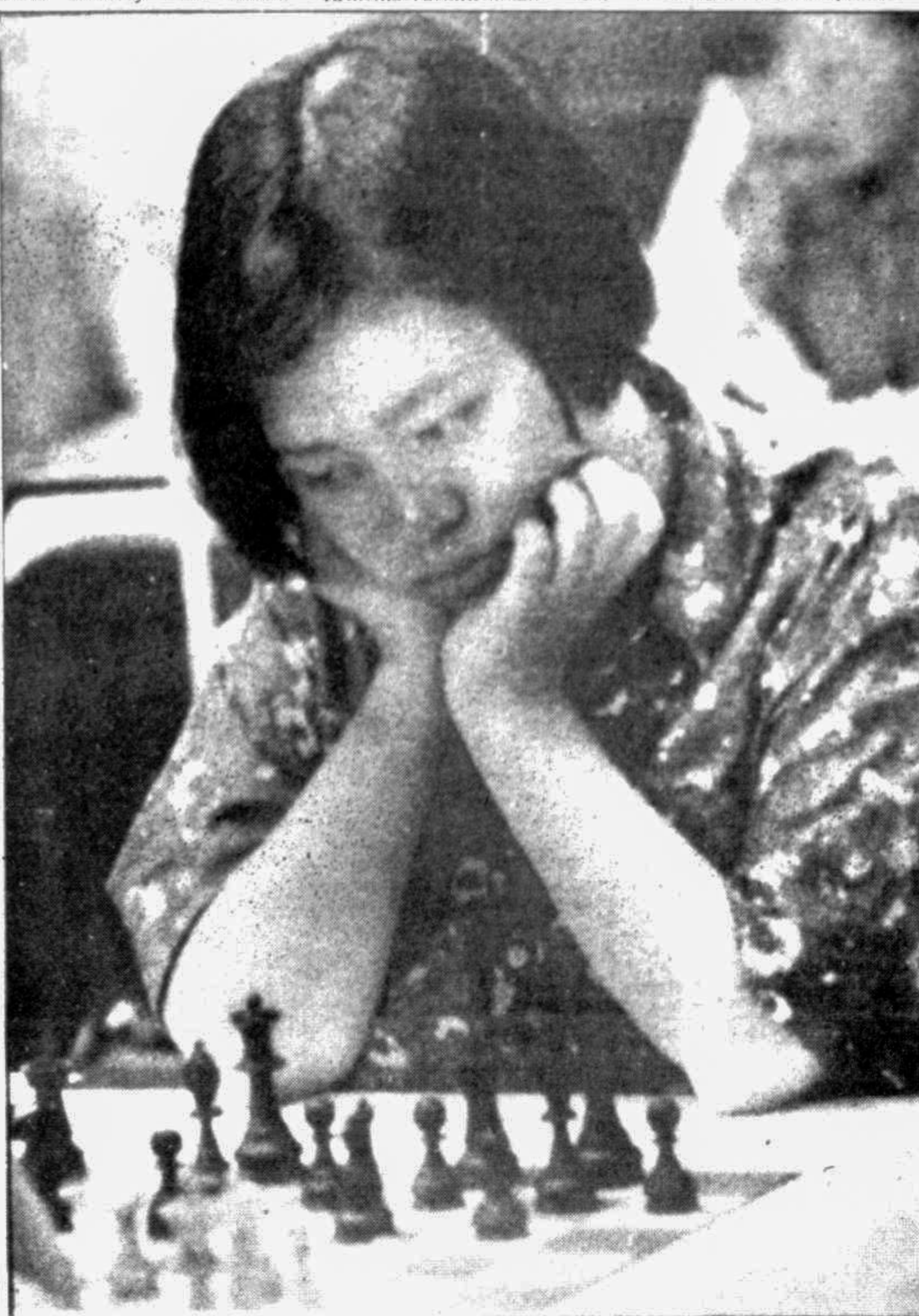
World women's champion Xue Jin of China ponders her next move against an Austrian opponent in the first round of the 30th World Chess Olympiad in Manila Monday.

The main results in the women's competition, with matches played over three boards, were: Georgia-Mongolia 3-0, Austria-China 0.5-2.5, Slovenia-Russia 0-3, France-Singapore 2.5-0.5. Standings after one round: 1. Georgia, Russia (3 points).