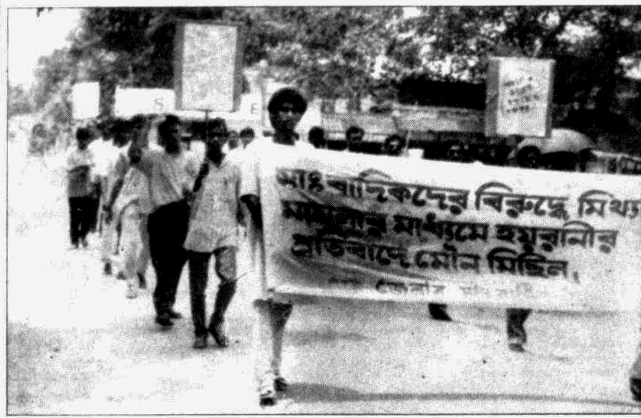
CHAPAINAWBANJ: The local newsmen brought out a silent procession protesting the harassment of Journalists through false cases by the administration on June 4.

June 6: A large number of students intending to take admission in 7 honours subjects of the Comilla Victoria Government College are going to be disappointed, reports UNB. College administration said a total of 2025 applications had been filed for 330 seats in the seven departments. The highest number of applications (475) were submitted for 60 seats in the Economics Department and the lowest was 81 for 30 seats in the Bangla Department. In Accountancy Department, 457 applications were received for 60 seats, in Political Science 317 applications for 50 seats, in Management 441 applications for 70 seats, in Chemistry 112 applications for 30 seats and in Physics 112 applications for 30 seats. Larger number of students have sought admission this 1992-93 session than that of the previous year. June 6: The oath-taking ceremony of Bangladesh Medical Association (BMA), Naogaon district unit was held recently at the local Coronation Hall, reports UNB. The BMA President Dr M A Majed attended as chief guest and administered oath to the newly-elected members. Civil Surgeon Dr Ali was in the chair. The BMA Secretary General Dr Gazi Abdul Huq and Deputy Director of Rajshahi Division, Health, Dr Rashid Uddin Chowdhury attended as special guests. Naogaon Zilla BMA Branch President Dr Nurul Islam Mondal and Secretary Dr A T M Shahjahan Ali spoke on the occasion.