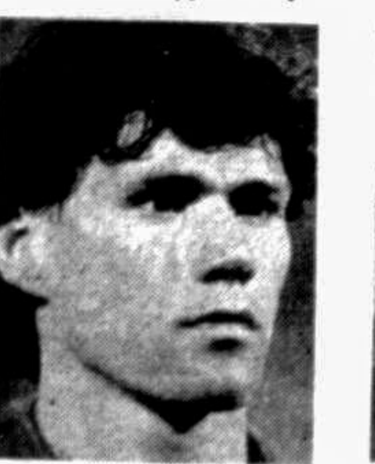
MARCO VAN BASTEN

Recent results: Netherlands 1 Poland 1; Netherlands 1 Portugal 0; Greece 0 Netherlands 2; Portugal 2 Netherlands 0; Netherlands 2 Yugoslavia 0; Netherlands 3 Austria 2; Netherlands 4 Wales 0.