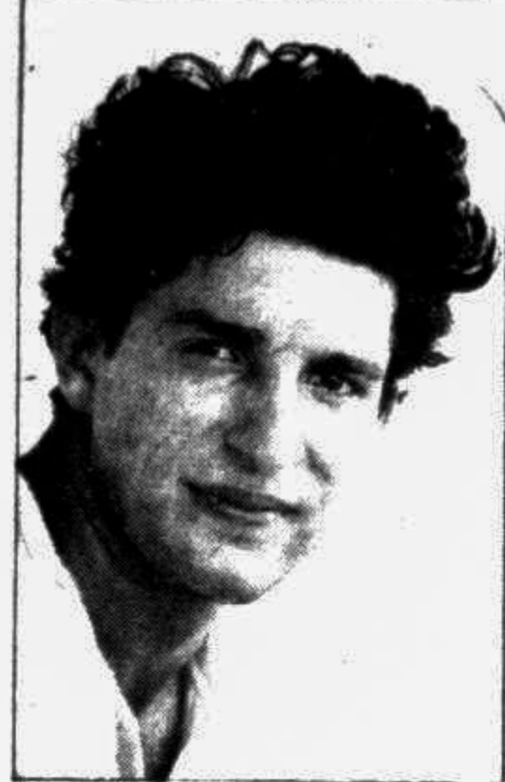
WASEEM AKRAM isled with his first workout since his stress-fractured shin