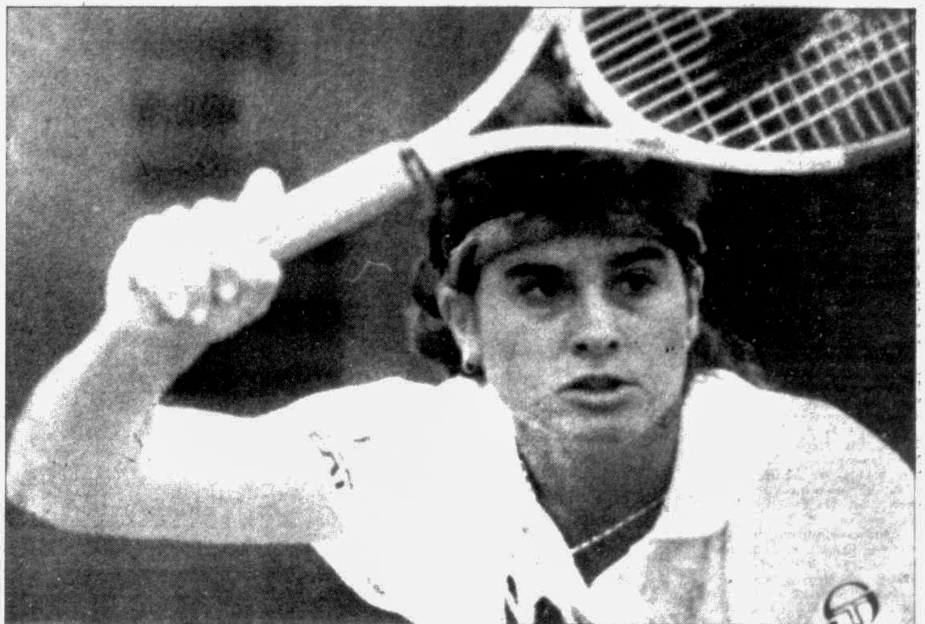
Argentinian Gabriela Sabatini returns a forehand to Spanish opponent Conchita Martinez during her quarter-final match at the French Open Tuesday. Sabatini will meet Seles in the semifinals.

"You see so many players coached by their parents, their fathers," she said. "Just don't push the child. I think a lot of parents of young children are doing that. I don't think it is worth anything because the child has to love the game."