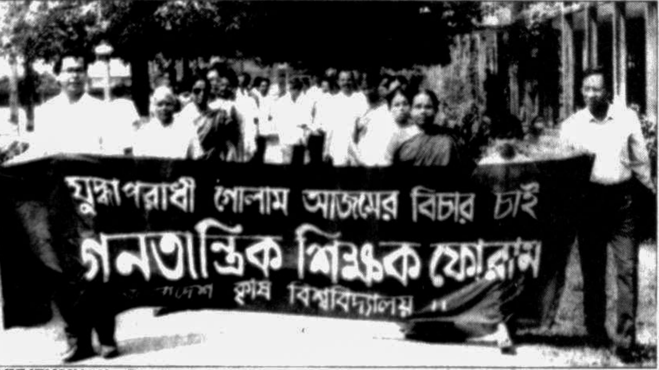
MYMENSINGH: The local unit of Democratic Teachers' Forum brought out a procession here recently demanding the implementation of 'public court' judgement.

The reports said that about 233 posts of teachers in the district have long been lying vacant.