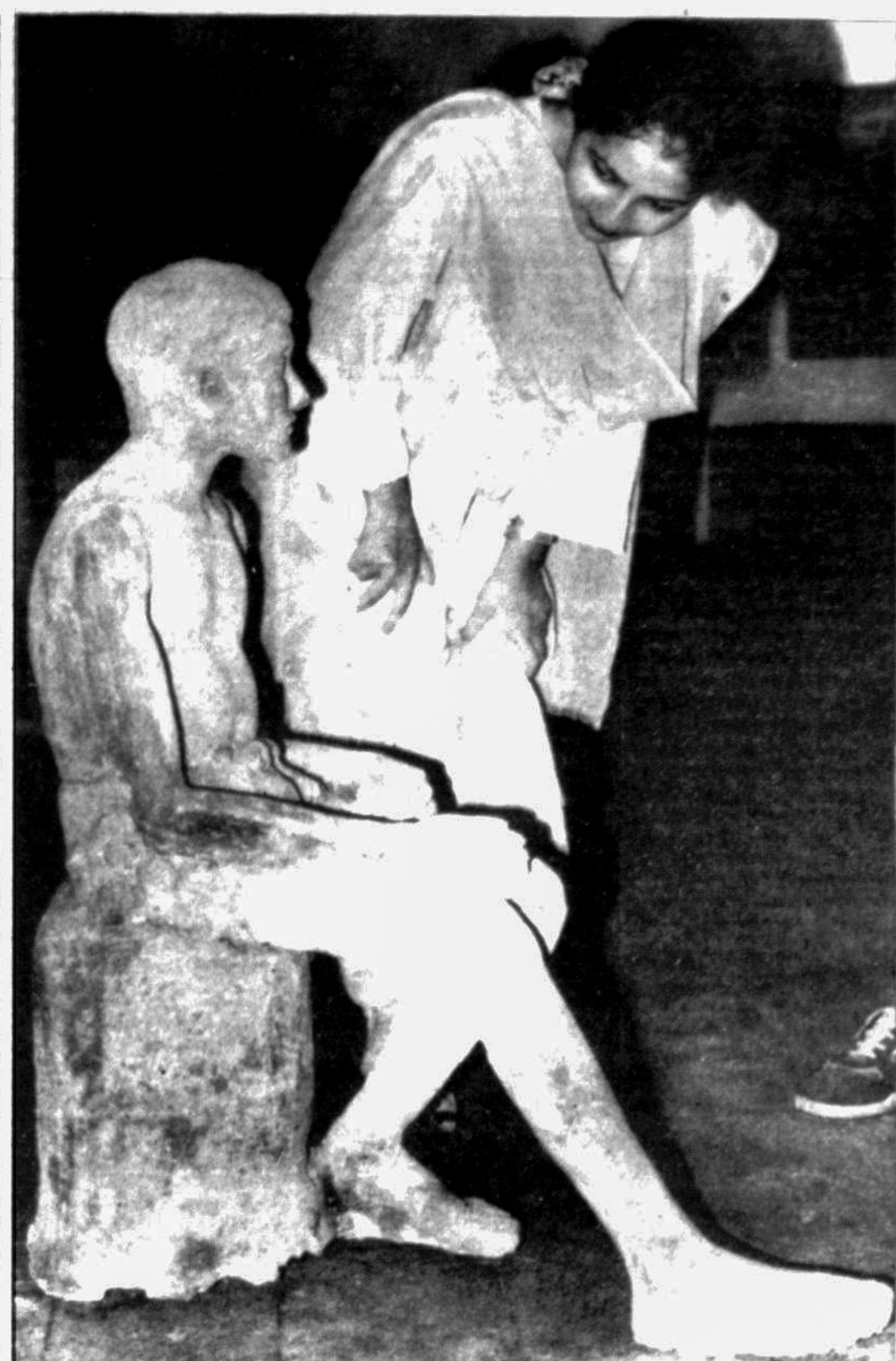
The annual exhibition of Art Institute began yesterday in the Institut gallery.