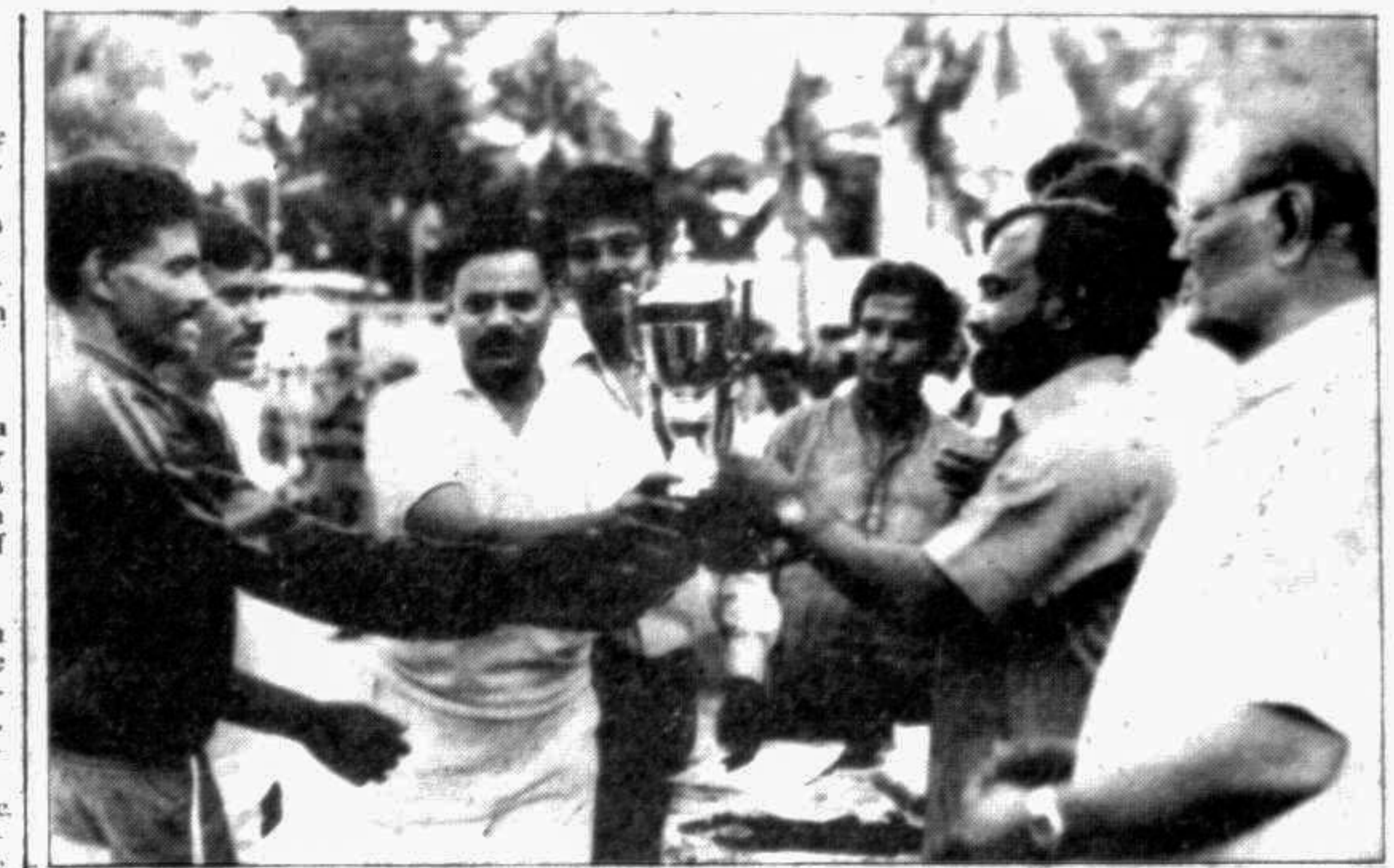
State Minister for Youth and Sports Sadeq Hossain Khoka giving away the national handball trophy to champions BDR at the Outer Stadium yesterday.

PORT OF SPAIN, Trinidad, June 1: Trinidad and Tobago beat Barbados 3-0 (half-time 0-0) in the second leg of a Concacaf Zone World Cup soccer qualifier on Sunday, reports Reuter.