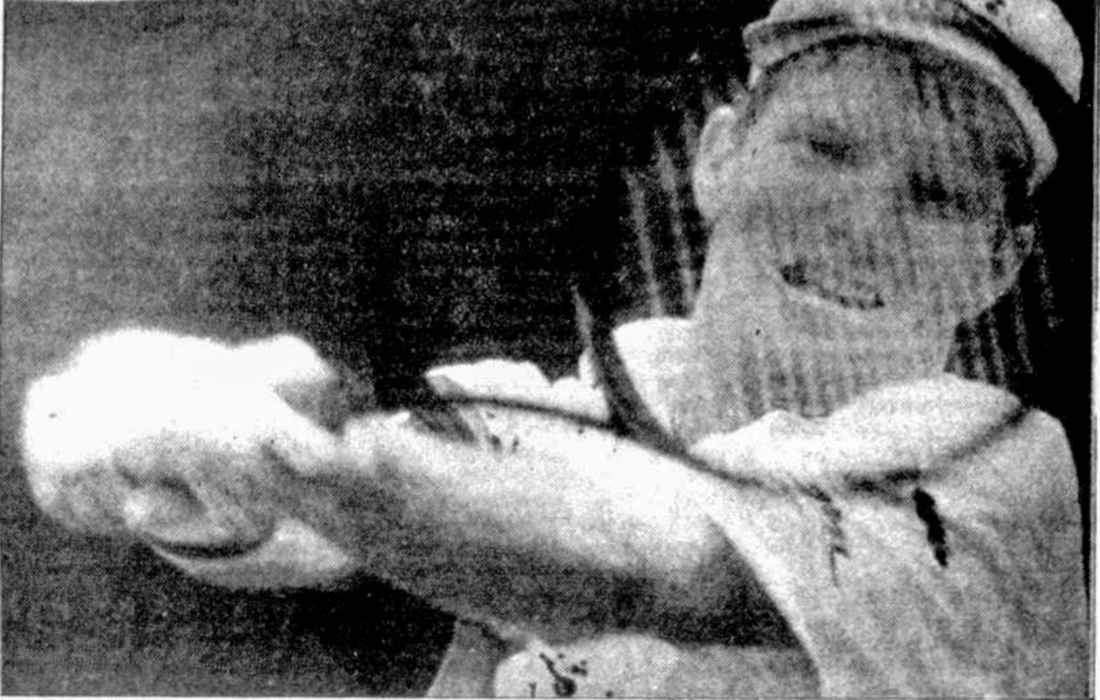
Defending men's champion Jim Courier of the United States returns a backhand to Kiev-born Andre Medvedev during his fourth round triumph in the French Open yesterday. Courier reached the quarterfinals with a facile 6-1, 6-4, 6-2 victory.

Argentine Sabatini, who has reached the Roland Garros semifinals four times, found only mild resistance from