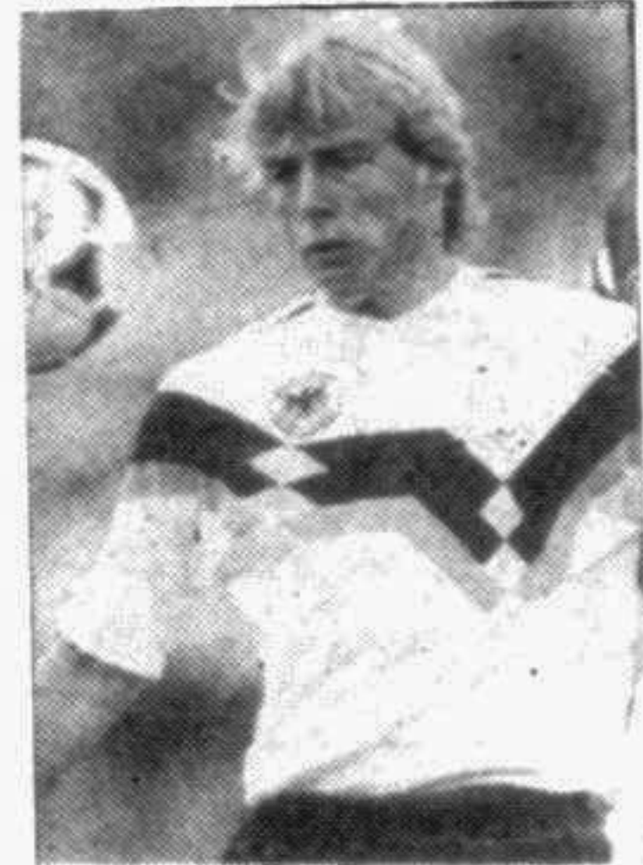
KLINSMANN ... key man

Vogts won't be able to field striker Karlheinz Riedle, who suffered a light neck injury in training Thursday.