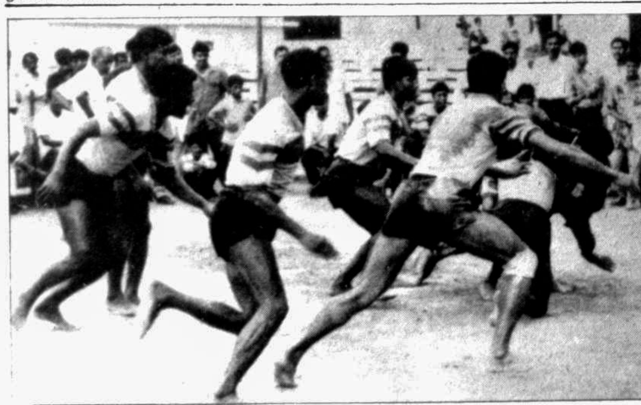
Action from the Premier kabaddi league at the Outer Stadium yesterday.

But the message from the city authorities is clear. Please come to the city, but leave your car outside.