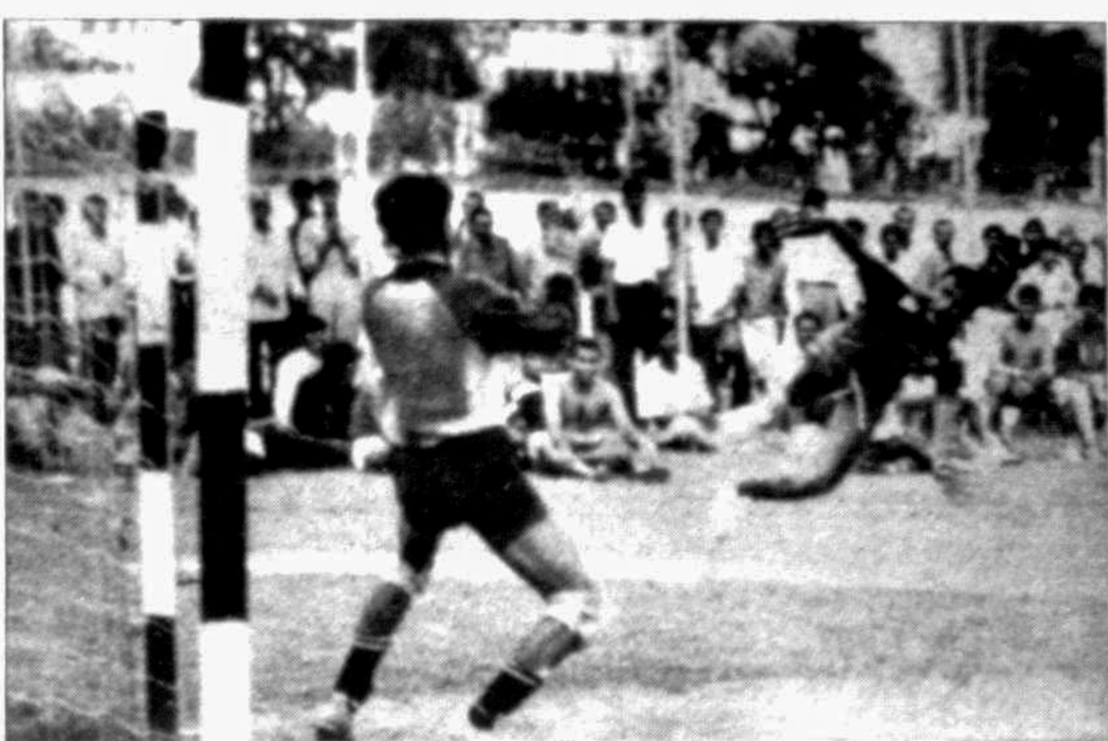
Action from yesterday's semifinals of the eighth national handball championship at the Outer Stadium.