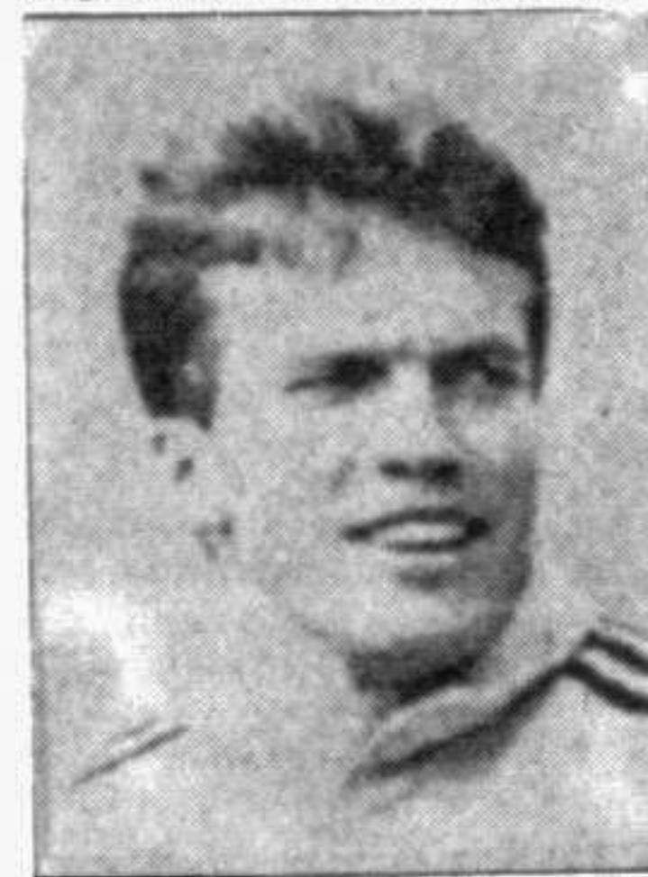
MATTHAUS ... absent in the key position usually reserved for Matthaus.

Sammer, a former East German, played a decisive role in guiding VfB Stuttgart to the Bundesliga title this season and national team coach Bert Vogts has decided to test him