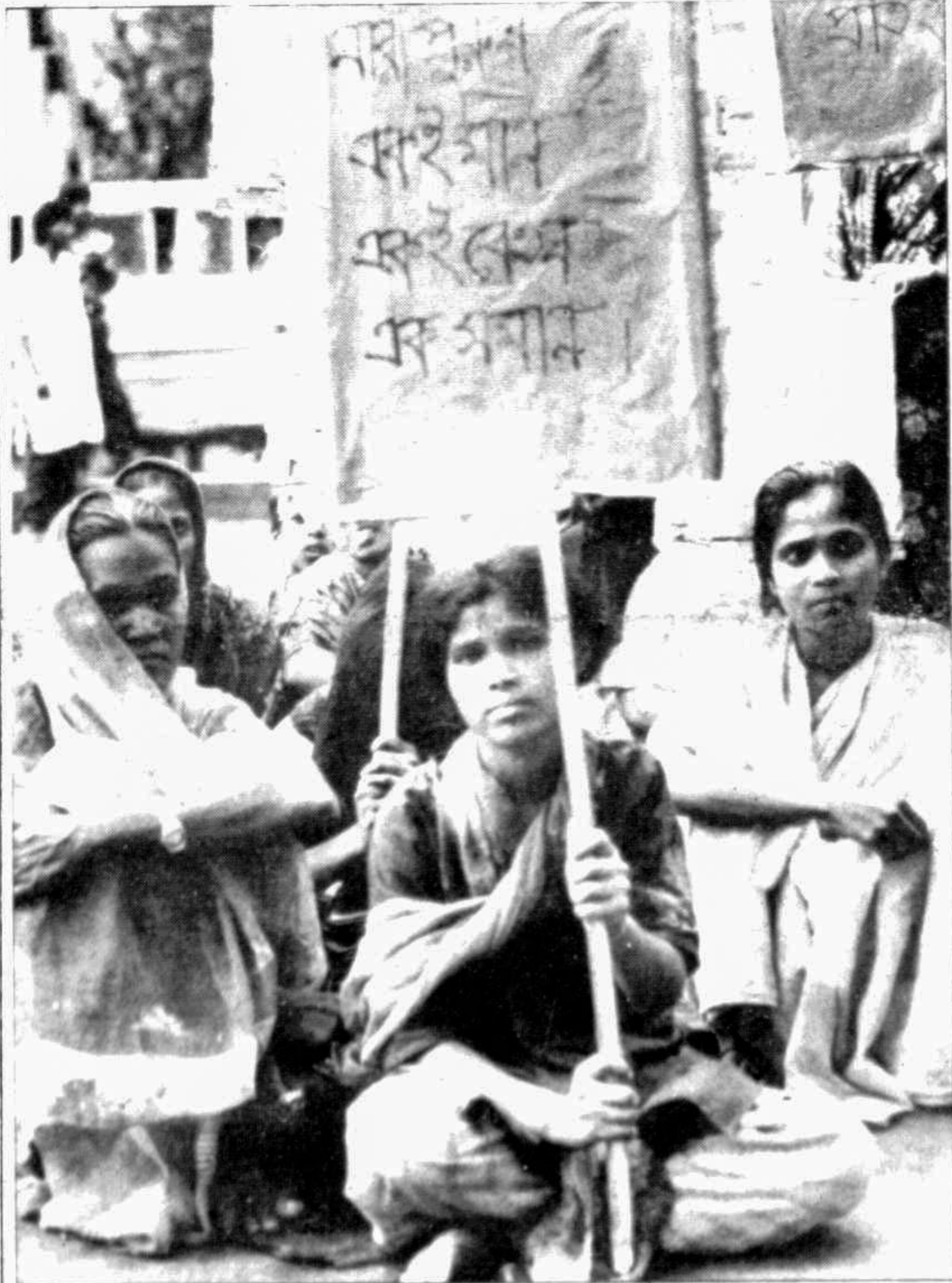
Garment employees held a rally in front of National Press Club demanding equal pay for men and women.

By Staff Correspondent The 11th death anniversary of President Ziaur Rahman will be observed today (Saturday). Shahed President Zia, a valiant freedom fighter and founder of the Bangladesh Nationalist Party (BNP) was assassinated at the Chittagong Circuit House on this day in 1981. The ruling BNP, its front organisations and various socio-cultural bodies have taken up elaborate programmes to observe the day with due respect. The day's programmes include holding Quran Khwani and milad mahfil, offering fatiha and laying wreaths at the mazar of the late President at Sher-e-Bangla Nagar in the city. Besides, discussion meetings on the life and works of the late president will be held in different parts of the country. At the BNP central office, party flag will remain halfmast and black flag will be hoisted marking the day. A Quran Khwani will start at Zia's mazar from 6 in the morning. BNP central leaders will place wreaths and offer fatiha at 9 am. A discussion under the auspices of BNP will be held at the Engineers' Institution at 4 pm. Central leaders of the See Page 12 Col 7