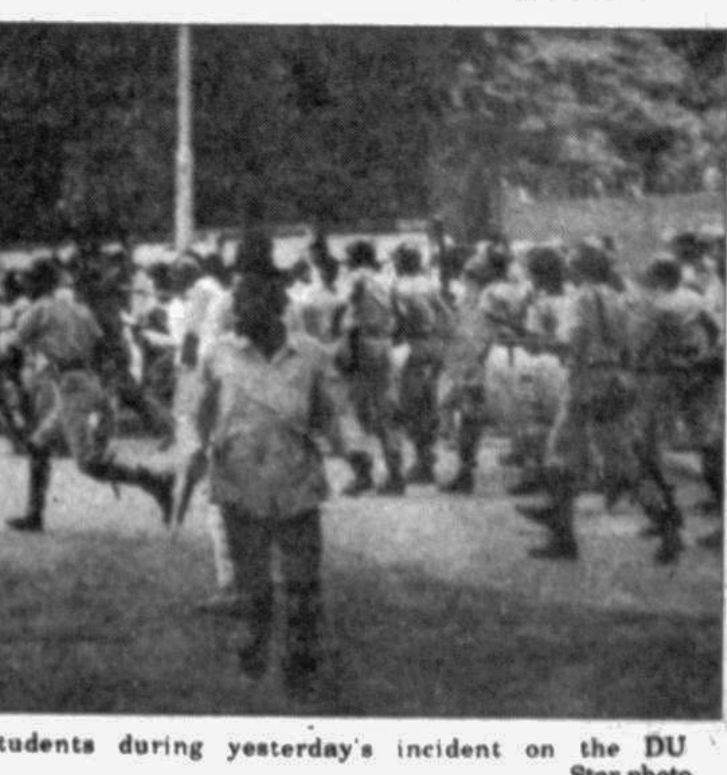
Police dispersing unruly students during yesterday's incident on the DU campus.

steel structures replaced. Besides the most precarious Ferris wheel, there are flying saucer, chair tower, electric train, merry-go-round, roller skates, trampoline, electric cars, baby bicycles, archery and flower cups at the 15-acre Shishu Park. Park sources said except for a few changes in 1990, no major maintenance job was done since opening of the park in 1979. They said plastic covers, metal ropes, nuts, bolts were replaced on many occasions but the metal structure of these rides were not changed. The foot-boards of some cabins on the Ferris wheel became worn-out and were replaced, the sources said, but not the steel rims, the main axle or the bearings on it. According to sources, the DCC spends nearly Taka 12 lakh every year for maintenance of the machines at the park which, they said, was too inadequate. "Almost all the machines here rotates or moves involving friction... and it is very likely that these will wear and tear in time," one source at the park said, adding that it was the high time these were replaced. "An unfortunate incident occurred." A maintenance worker at the park, who requested not to be named, said that apparently all the machines looked well. "But we do not know what the condition is inside the metal structures of these See Page 12 Col 8