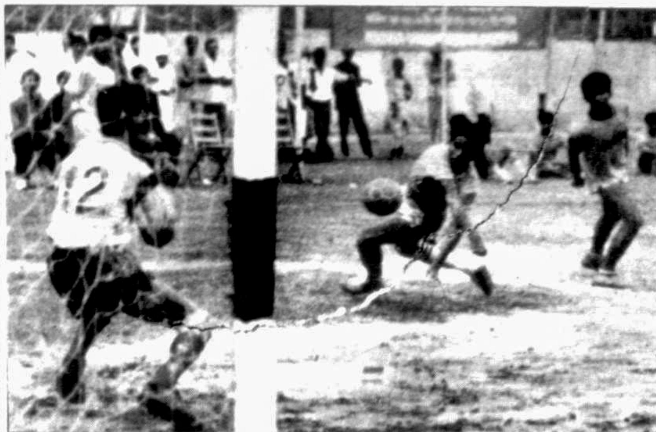
Action from the national handball championship which began at the Outer Stadium handball court yesterday.

A seven-member Bangladesh shooting team leaves for Munich today, to take part in two UIT World Cup Championships being held in Germany and Italy, reports UNB.