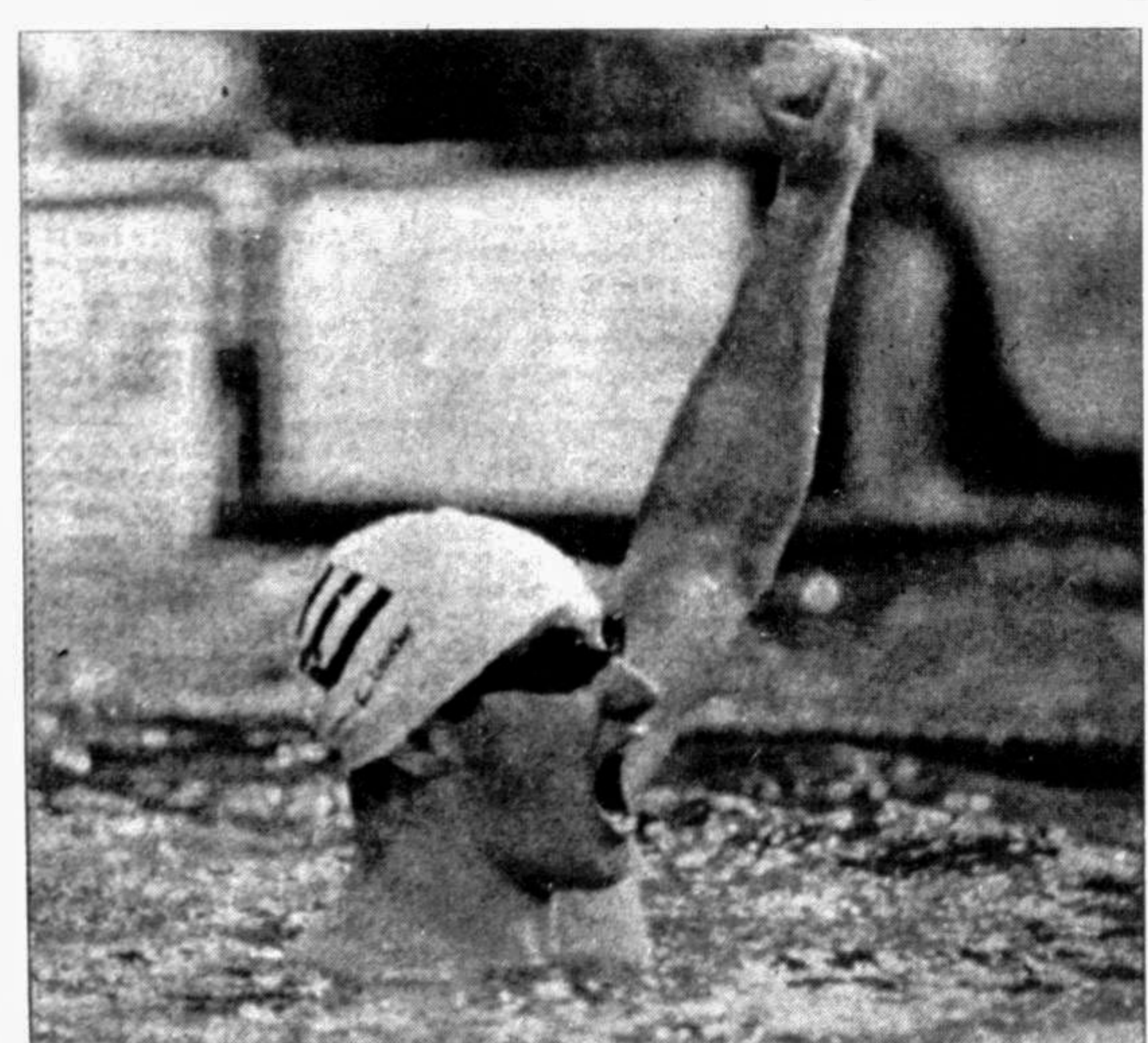
MARTIN ZUBERO ... Spain's best medal hope

FORT LAUDERDALE, Fla., May 25: World record holder Martín Zubero of Spain is beginning to feel the spotlight that goes with being an Olympic gold medal hopeful and a national hero, reports Reuter.