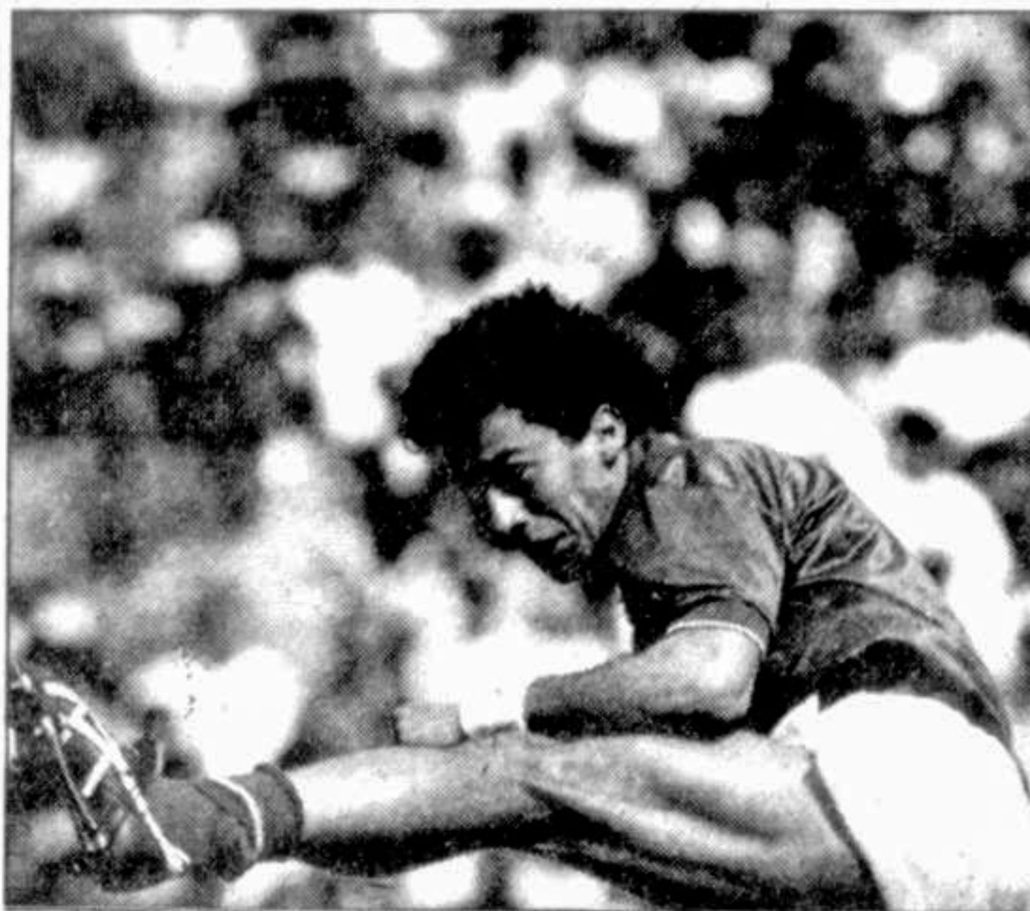
GIANLUCA VIALLI ... biggest-ever soccer transfer

ROME, May 24: Italian club Sampdoria will get four new players plus a cash payment in the record-breaking deal which takes striker Gianluca Vialli to Juventus, newspapers reported on Saturday, reports Reuter.