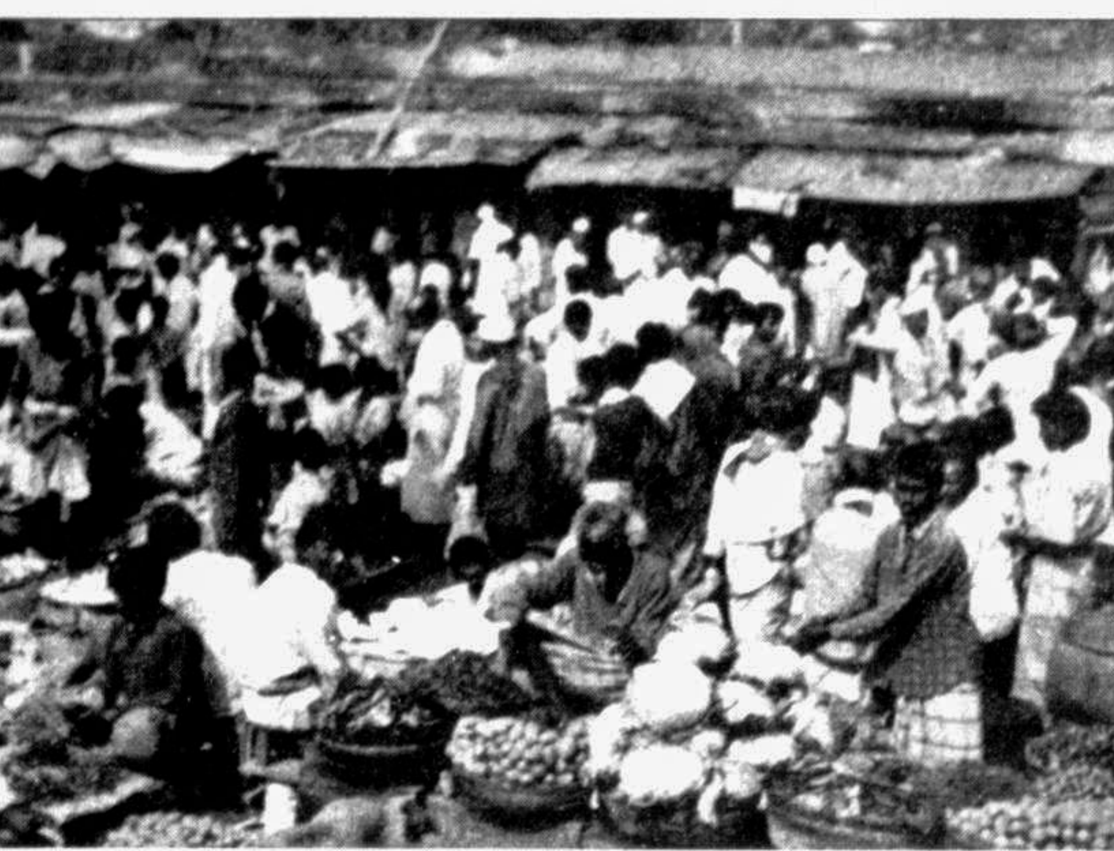
MOULVIBAZAR : Paschim Bazar, the main fish and vegetables market of the town, has no shed.

The Asian Development Bank (ADB) has been financing the project for improving rural sanitation.