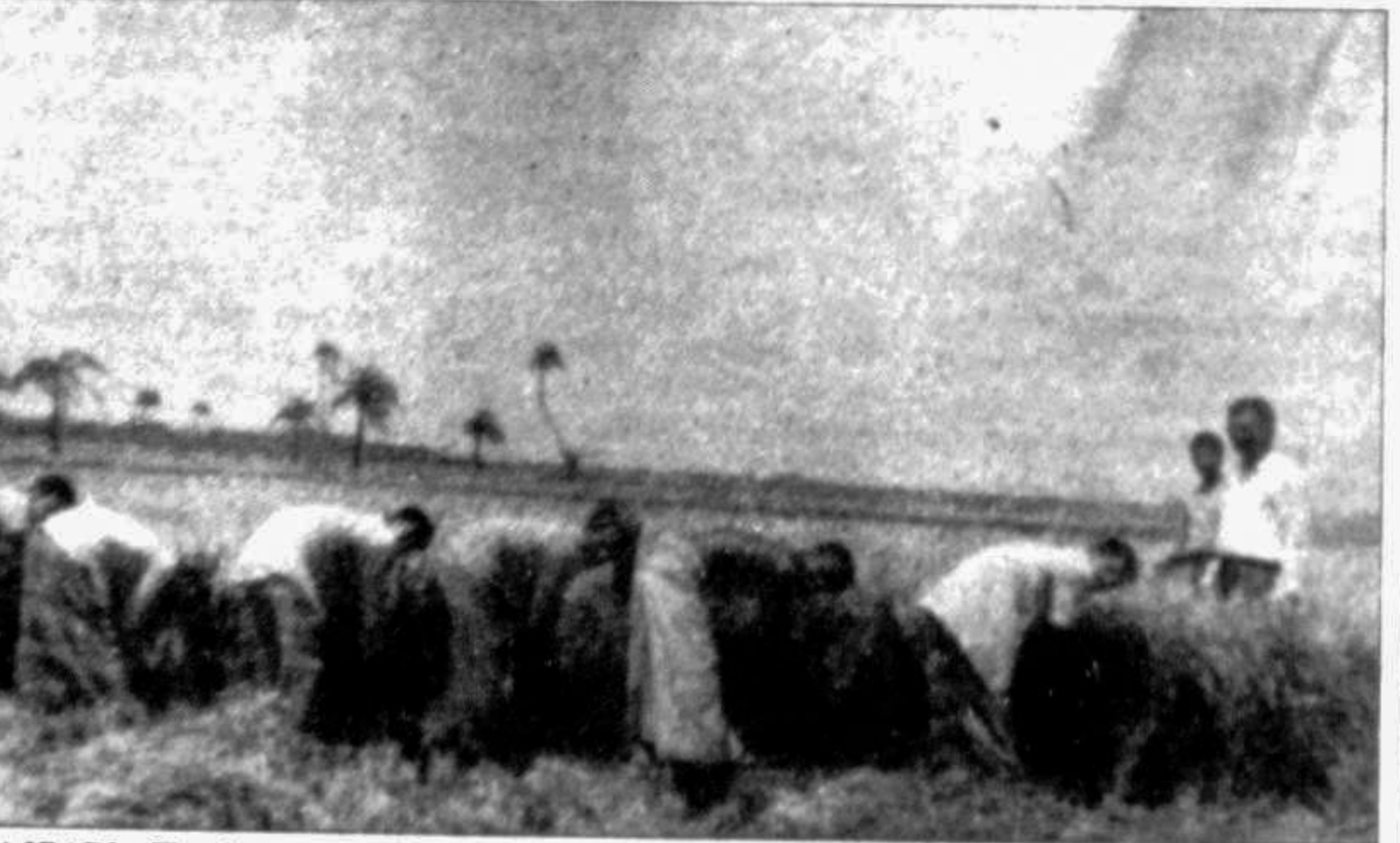
RAJBARI : The farmers are harvesting the paddy.

Officials informed the minister that on an average 150 patients are accommodated in the hospital.