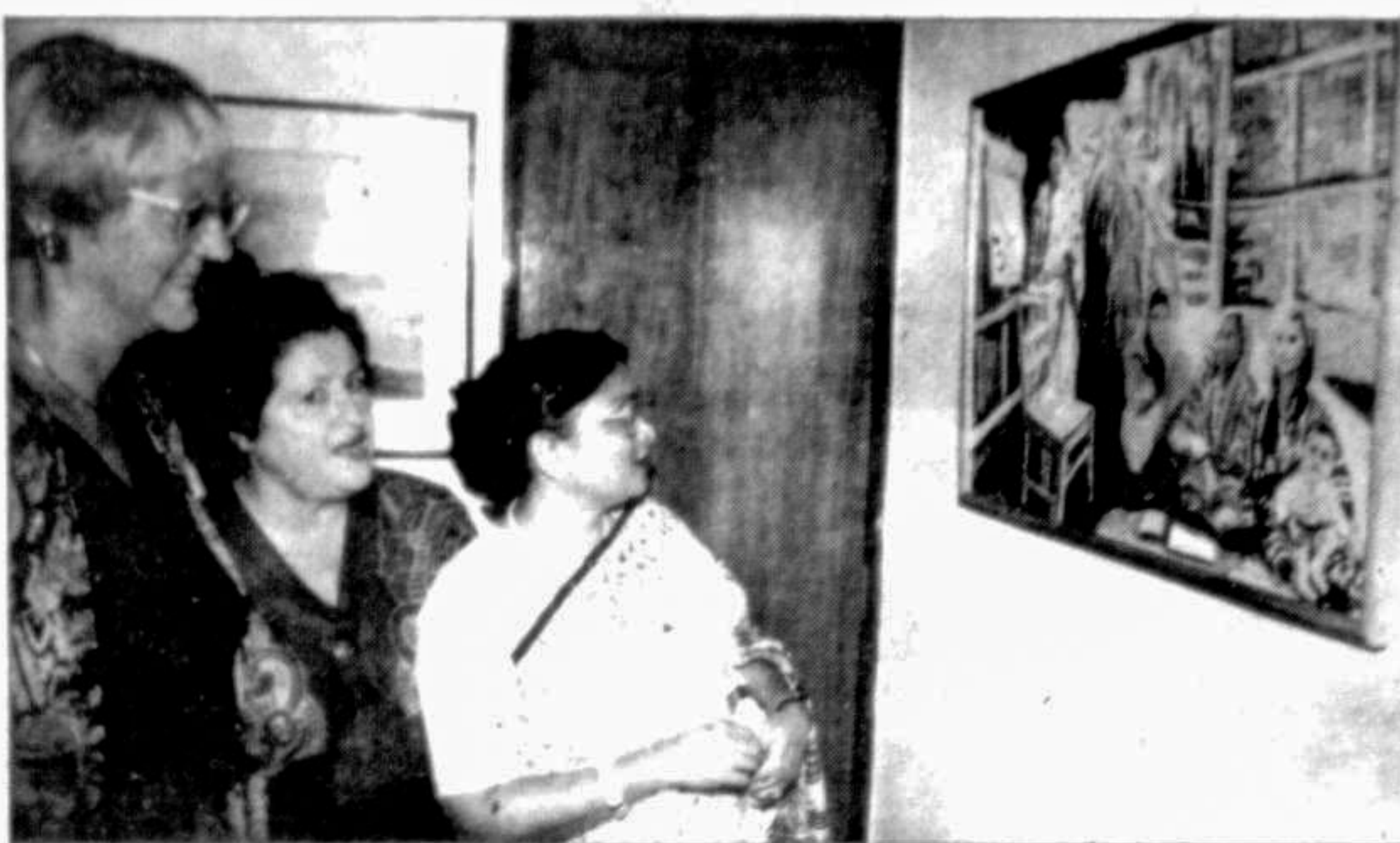
An exhibition of paintings by Bangladeshi and foreign artists was held at the residence of Turkish ambassador Saturday.