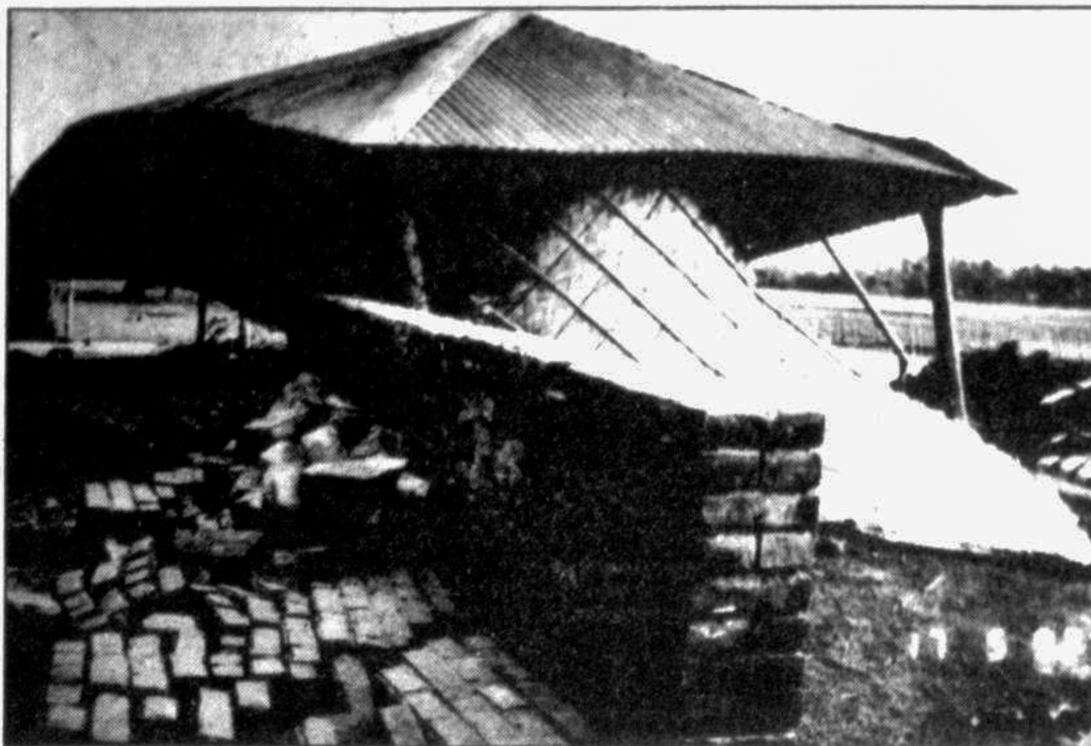
PABNA: The tin-shed building of a school in Bera Upazila has been damaged by a recent nor'wester.

Common people and businessmen of the town have urged the authority to take steps towards ensuring smooth supply of electricity.