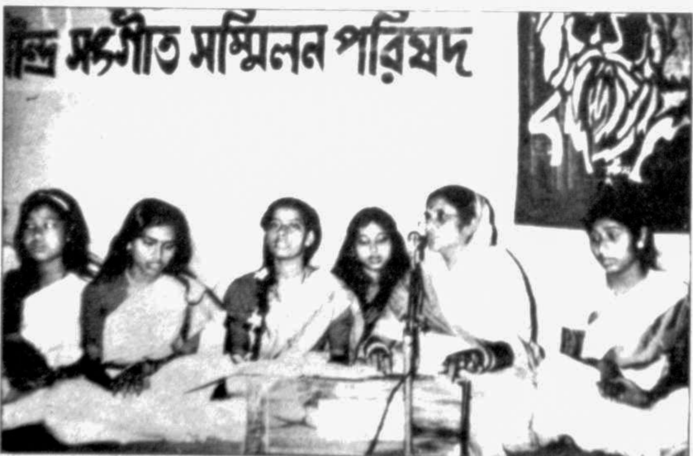
MAULVIBAZAR: Local artistes rendering songs at a function organised on the occasion of Tagore's birth anniversary.

A case has been lodge with the local police.