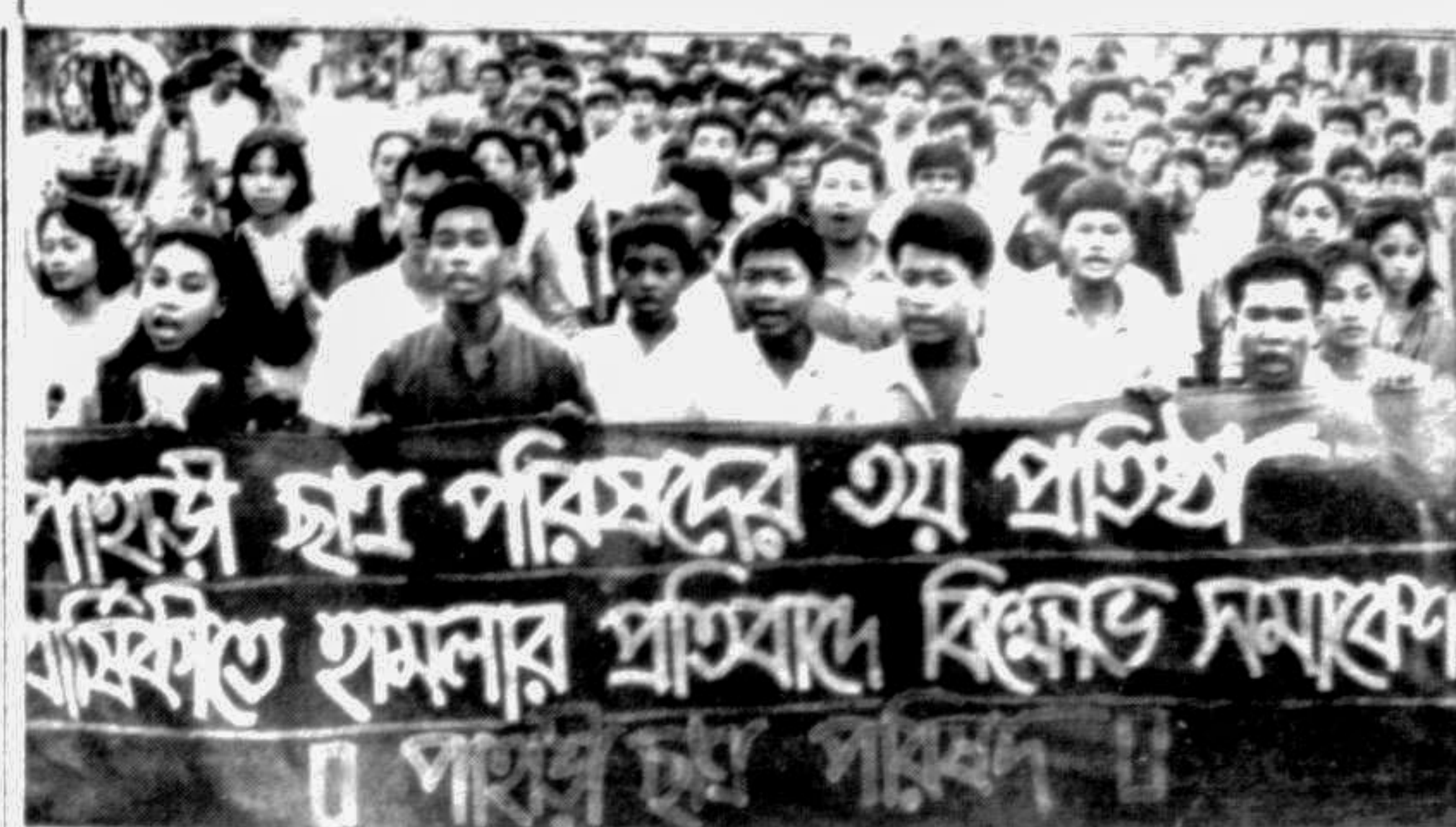
A procession of the Pahari Chhatra Parishad in the city yesterday in protest against attack on their third founding anniversary programme at Rangamati.

Earlier, the Foreign Minister formally laid the foundation stone of the science building of Bagerhat Government Girls' College. He also addressed a students rally there.