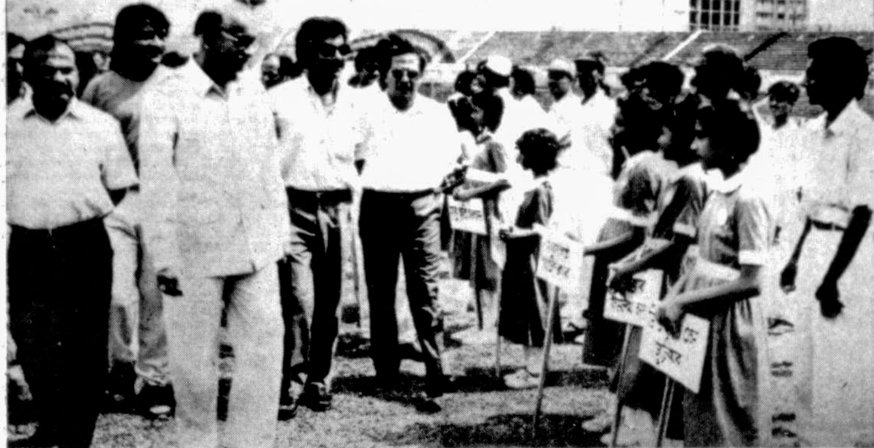
Foreign Minister A S M Mustafizur Rahman and other BCCB officials being introduced to the teams at yesterday's inauguration of the Second Division cricket qualifying meet at the Dhaka Stadium.

cial guest. Officials of the Bangladesh Cricket Control Board (BCCB) were also present at the opening ceremony that was marked by a grand rally of the participating teams and releasing of multi-coloured balloons. With Lekha Chhere Maath, one of the teams pulling out of the competition, the 73 teams split into eight groups fight for