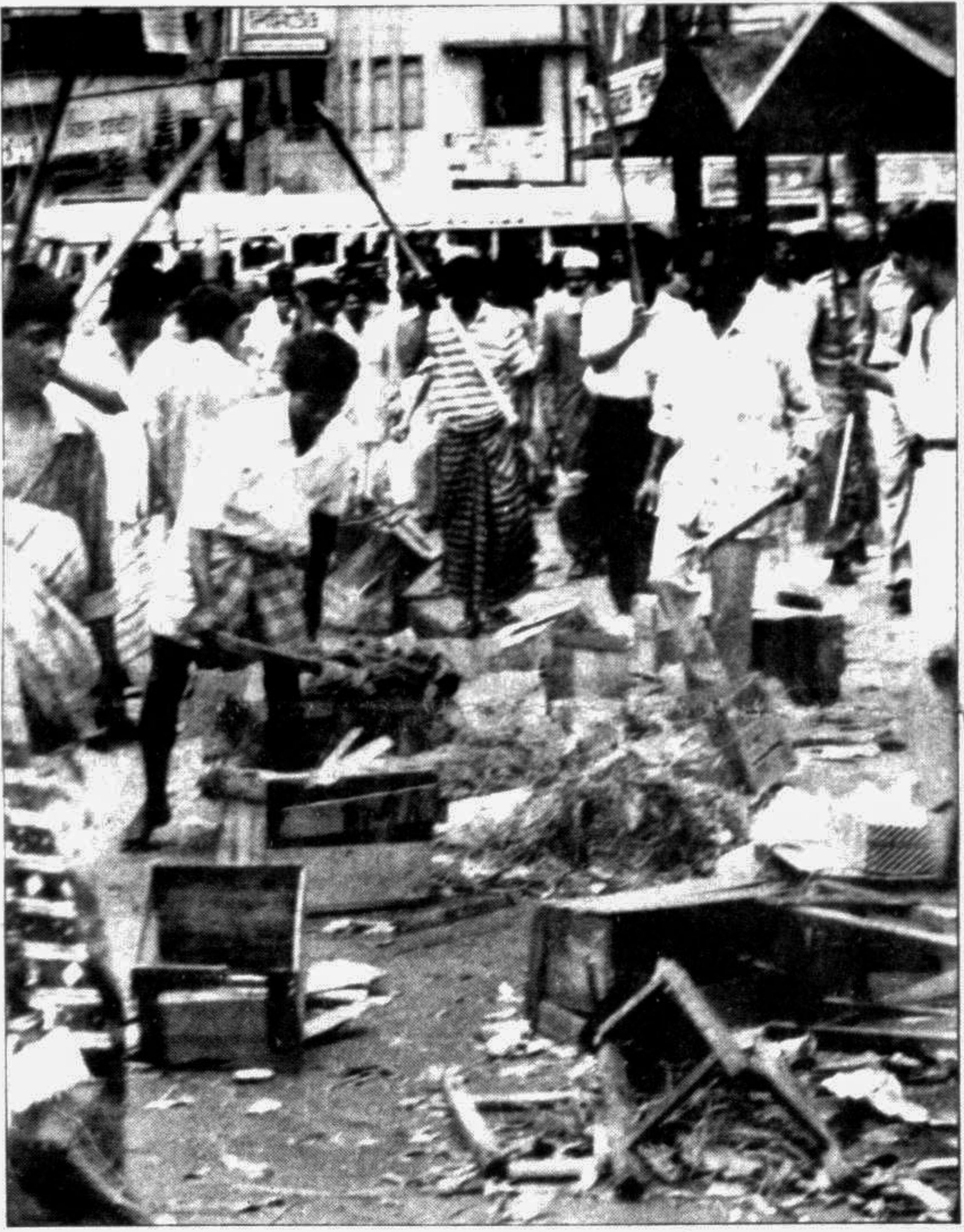
Merchants' men forcing hawkers out of Baitul Mukarram pavement yesterday. Story on back Page.